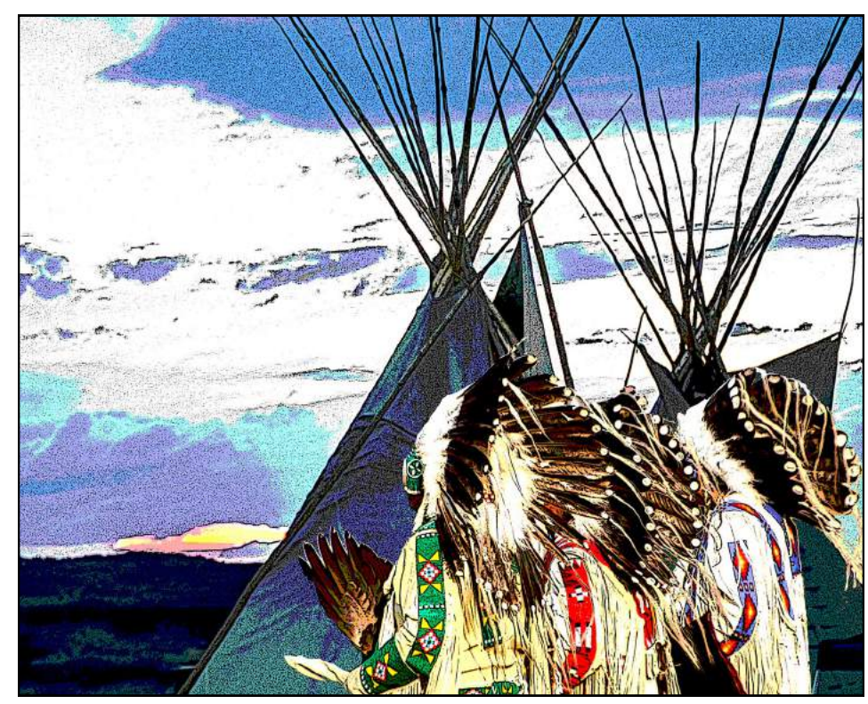
Chiefs at Heart Butte Celebration, 2014 Digital Photograph