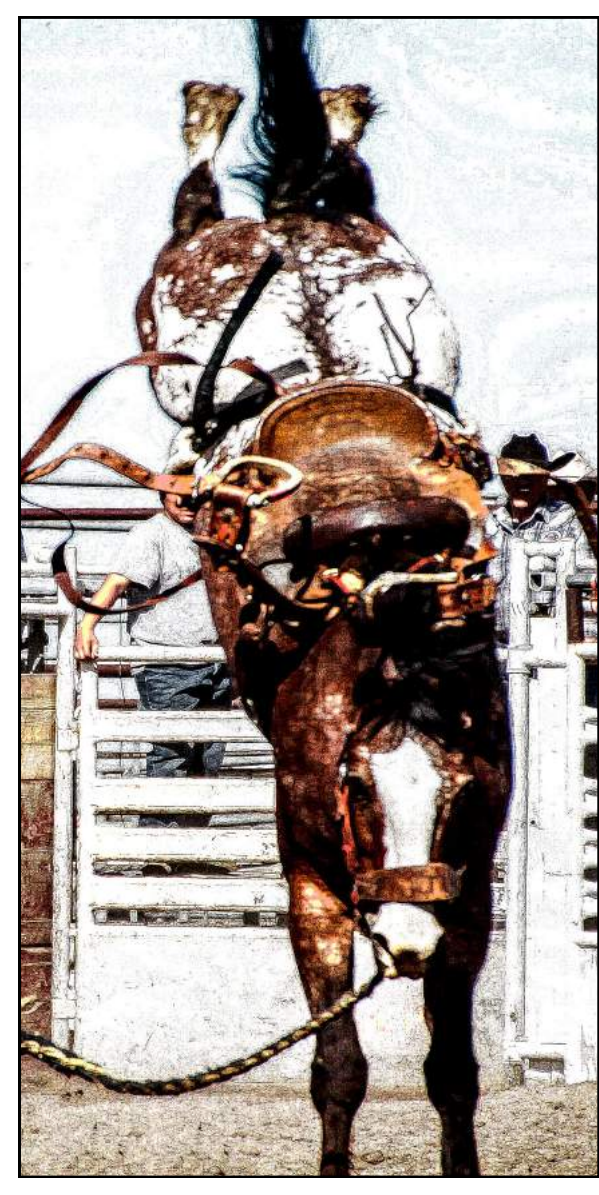
Could Have Been 80, 2013 Digital Photograph