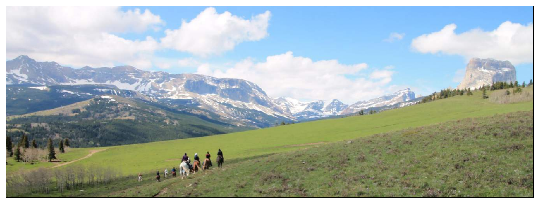
Riding to Chief Mountain, 2013 Digital Photograph