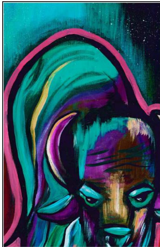
When I Forget Where I Come From Acrylic and Aerosol Paint on Canvas © 2016 Tammy Eagle Hunter