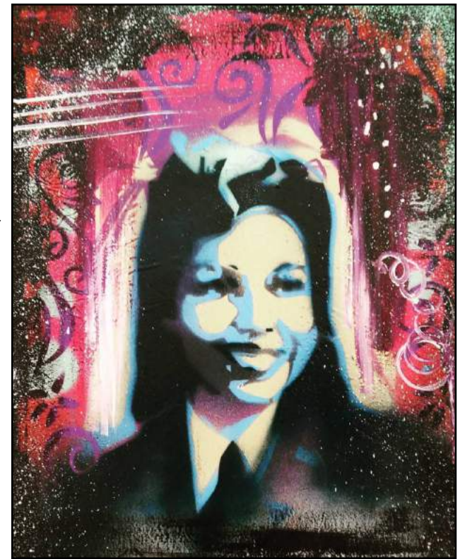
Be A Good Ancestor (Marcella) Acrylic and Aerosol Paint on Canvas © 2016 Tammy Eagle Hunter