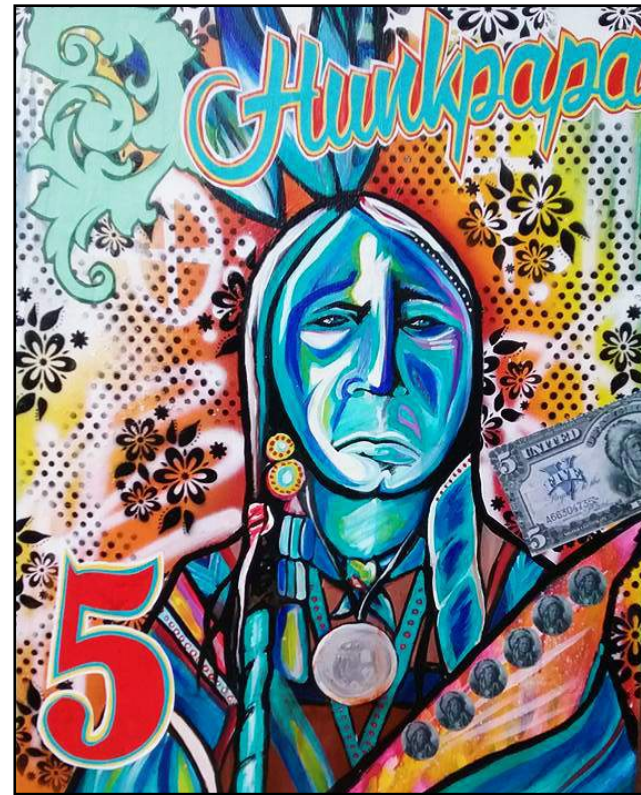
The Stories You Tell about Me Acrylic and Aerosol Paint on Canvas © 2016 Tammy Eagle Hunter