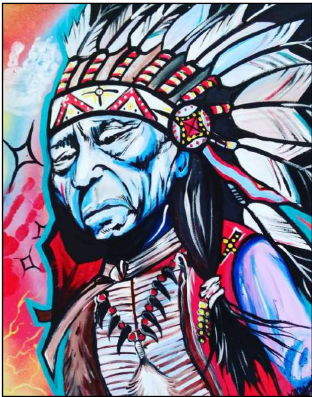
Black Elk Acrylic and Aerosol Paint on Canvas © 2016 Tammy Eagle Hunter