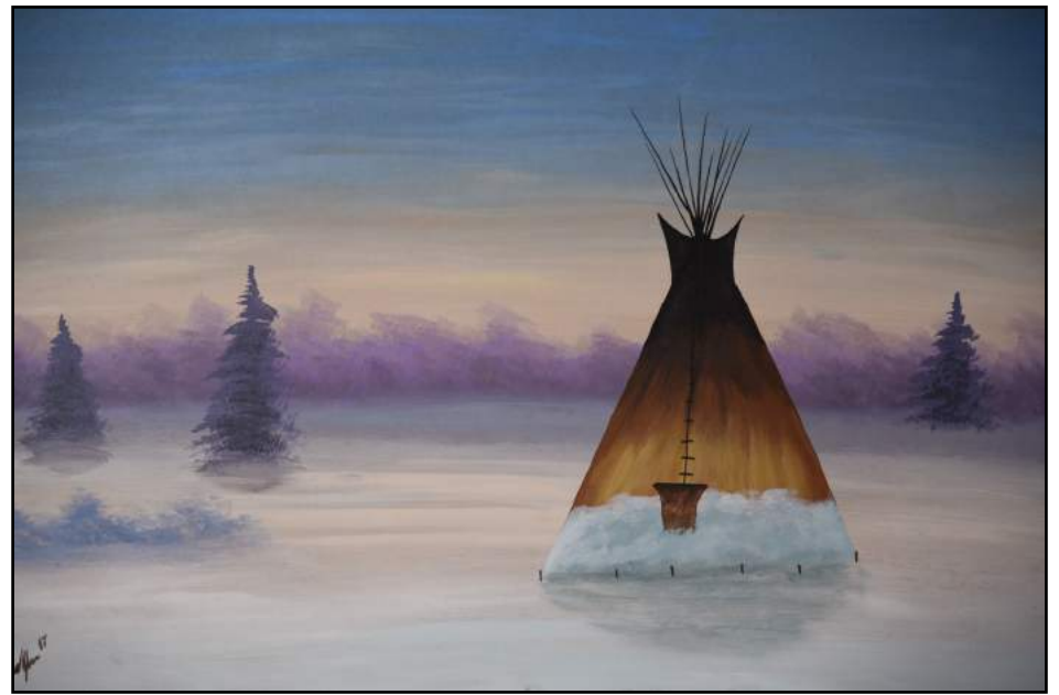
Solitude of Winter Acrylic on canvas © 2017 Jeremy Johnson