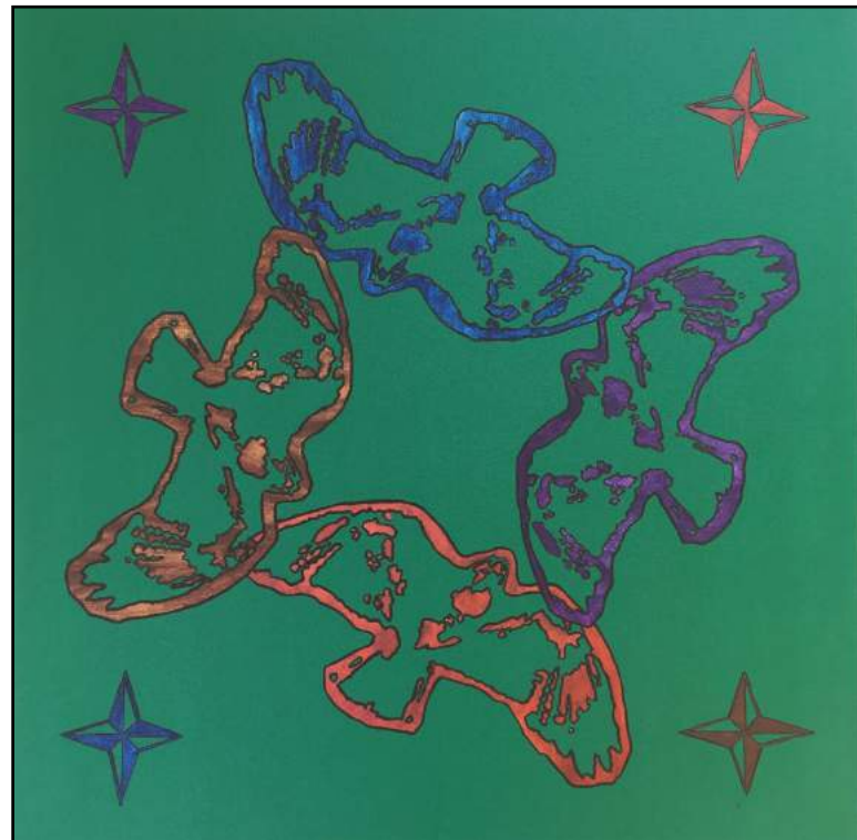
Drift Acrylic on canvas © 2017 Karma Henry