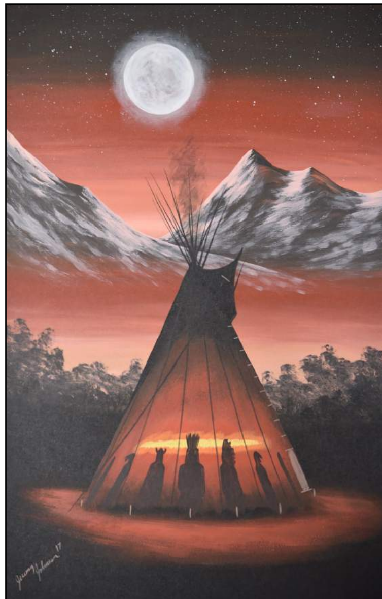
Midnight Council Meeting Acrylic on canvas © 2017 Jeremy Johnson

Exhibition August 4 – September 30, 2017