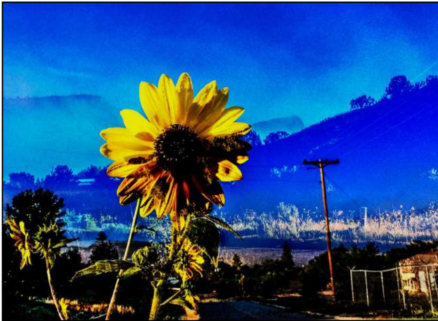
Blaze of Glory Digital photograph on archival paper © 2017 David Velarde Jr.