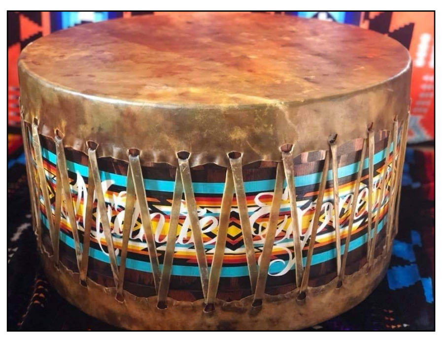
Blackfeet Drum Wood, hide, acrylic paint © 2019 Zachary Lame Bear