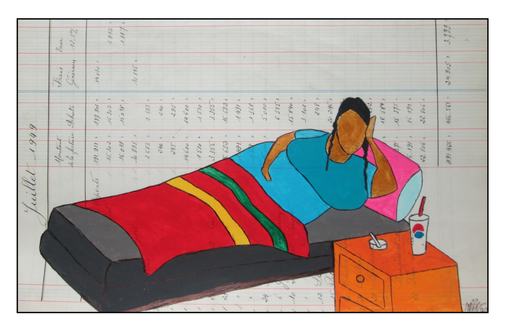
Waiting and Mad "The Remix" Colored pencils and ink on ledger paper © 2019 Michael Fast Buffalo Horse