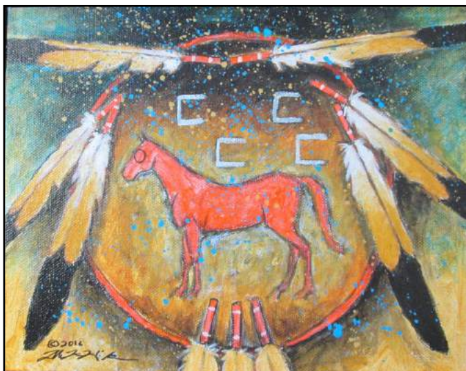
Warrior Horse Shield Acrylic on Canvas © 2016 Allen Knows His Gun