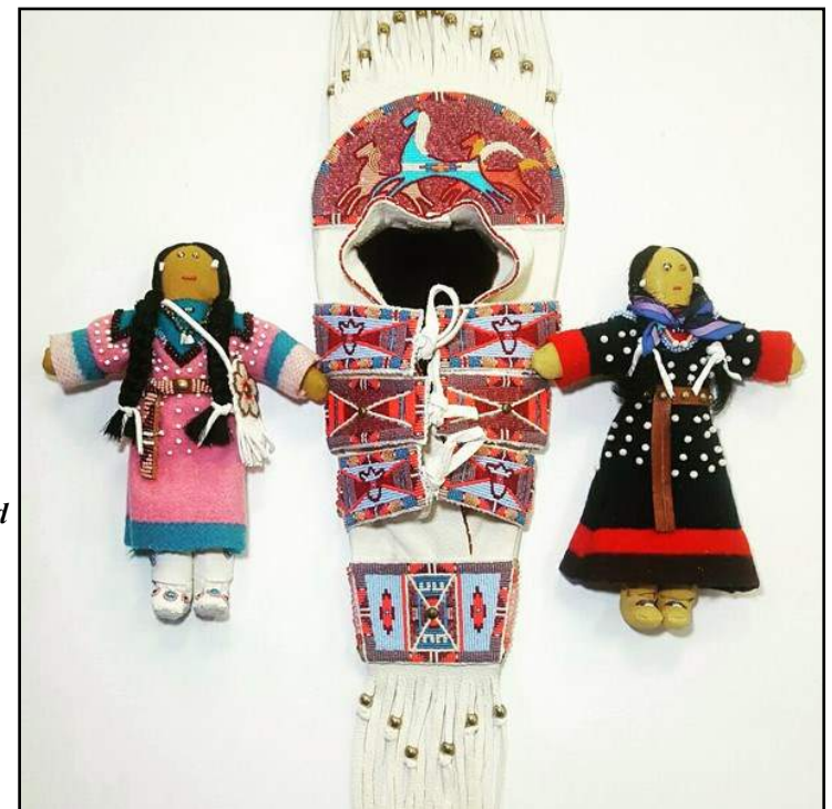
Dolls and Cradleboard Mixed Media © 2018 Karis Jackson