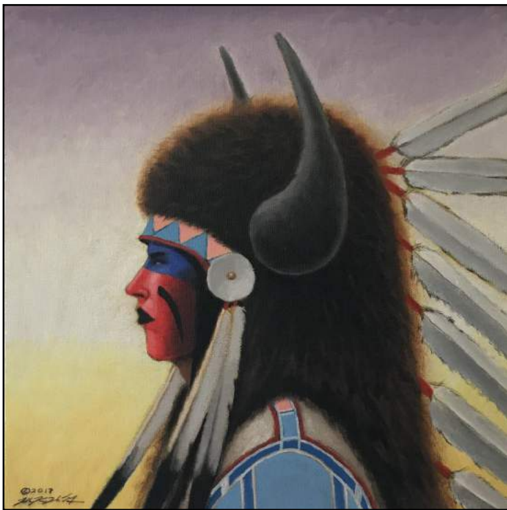
Iron Bull in Summer Acrylic on Canvas © 2018 Allen Knows His Gun