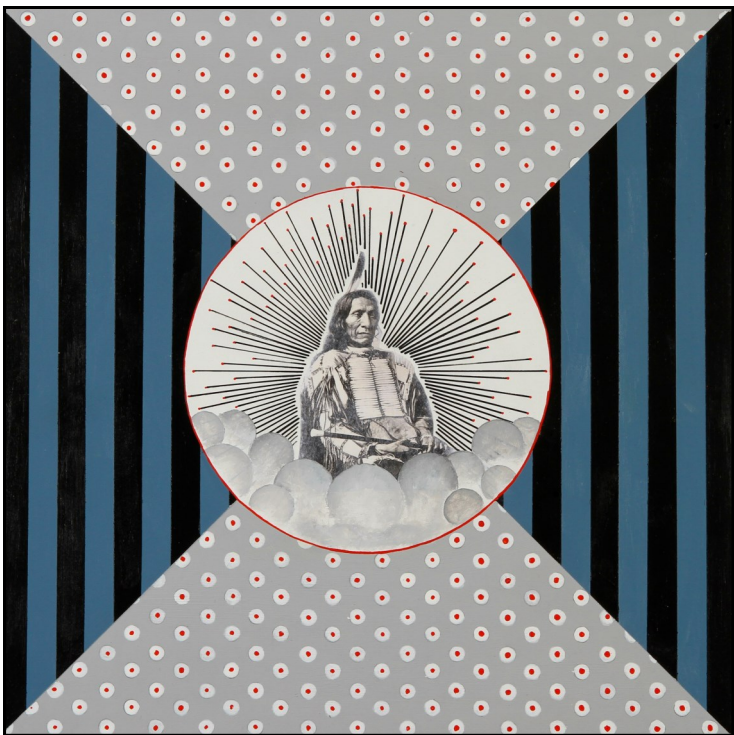
The Men of Wisdom #4 Mixed Media © 2015 Paul High Horse