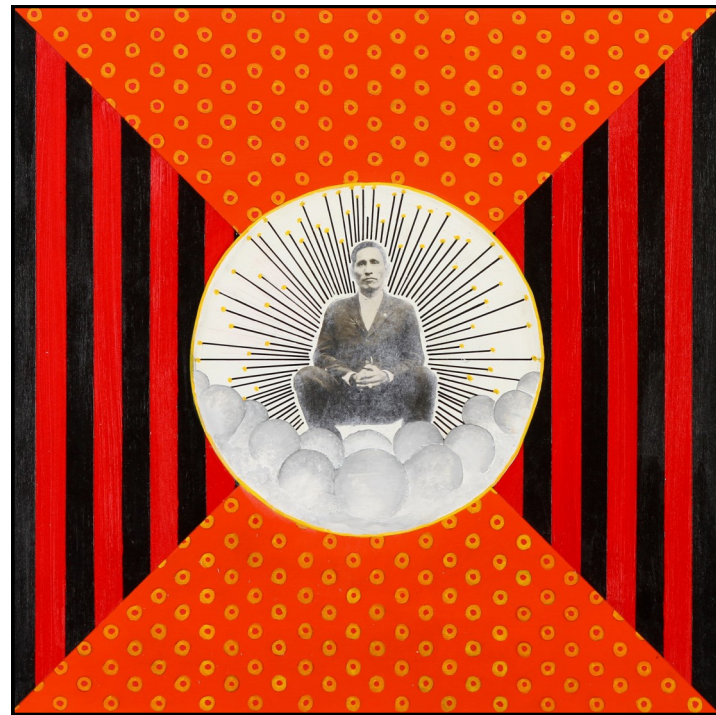
The Men of Wisdom #3 Mixed Media © 2015 Paul High Horse