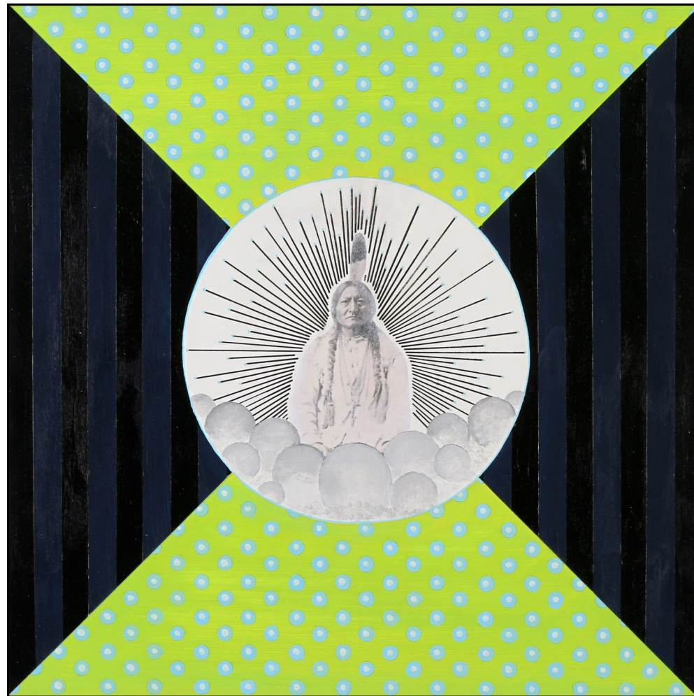
The Men of Wisdom #1 Mixed Media © 2015 Paul High Horse

Sioux Indian Museum 222 New York St. Rapid City, SD 57701 (605) 394-2381