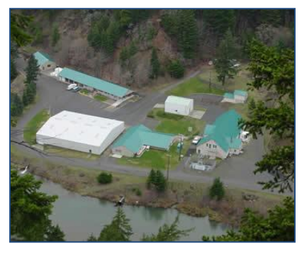
Little White Salmon Fish Hatchery FWS Facility