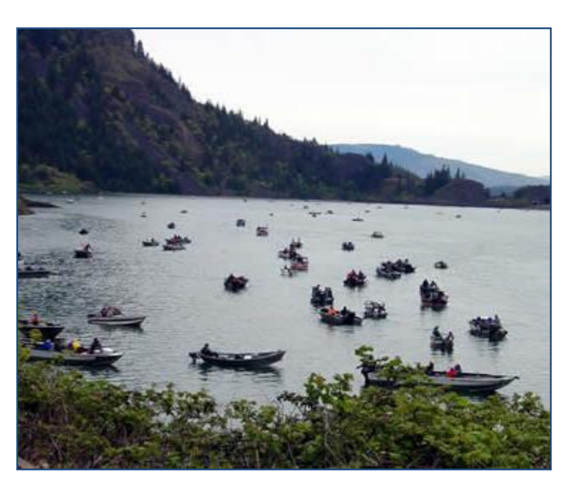
Drano Lake Recreation Area