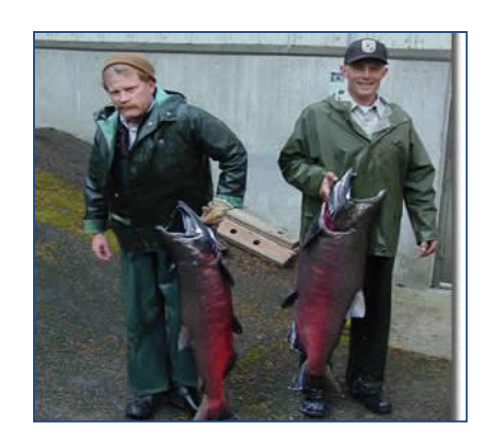
Chinook salmon – Listed Species