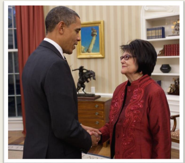
President Barack Obama with the late American Indian Activist Elouise Cobell

Purchased interests will be immediately held in trust for the tribe with jurisdiction over the land.