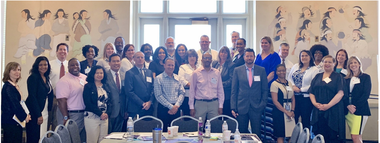
DOI senior leaders gathered for a workshop to discuss the findings of an HR assessment study.