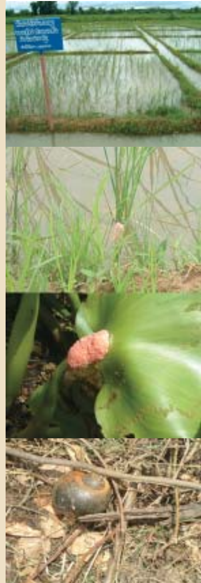
Rice paddy attacked by GAS, rice stalks with eggs, eggs on water hyacinth, GAS shell.