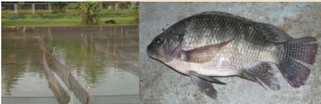
Tilapia aquaculture pond in Philippines, tilapia specimen.

Some development agencies have begun to recognize the links between development projects and IAS. For example, USAID has sponsored this assessment to better understand the linkage between development projects and IAS in the freshwater systems of Southeast Asia; the Swedish International Development Cooperation Agency has sponsored a study on the role of alien species in aquaculture in the Mekong.