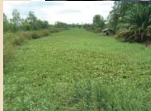
Canal in Thailand covered with water hyacinth, detail of flower. (A.Gutiérrez)