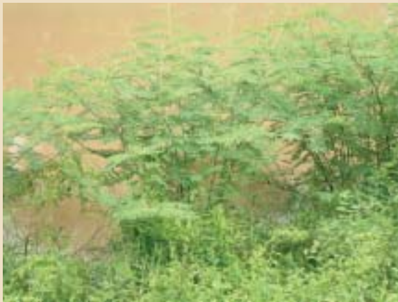
Mimosa pigra . (A. Gutiérrez)

As economic development and integration progress in Southeast Asia, the increased trade flows and sectoral development, especially hydroelectric, will face new challenges from IAS. Development agencies need to work with national governments, industry, and non-governmental organizations to build IAS prevention policies and practices into future agreements and projects. Recommendations for how development agencies can contribute to addressing IAS in Southeast Asia are listed in the Summary of Recommendations.