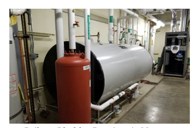
Boiler at Blackfeet Dormitory in Montana

Funds requested in FY 2021 will be used for structural design of buildings requiring seismic retrofitting. This program is in compliance with provisions of Executive Order 12941, Seismic Safety of Existing Federally Owned or Leased Buildings, which requires Federal agencies to assess and enhance the seismic safety of existing buildings that were designed and constructed without adequate seismic design and construction methods.