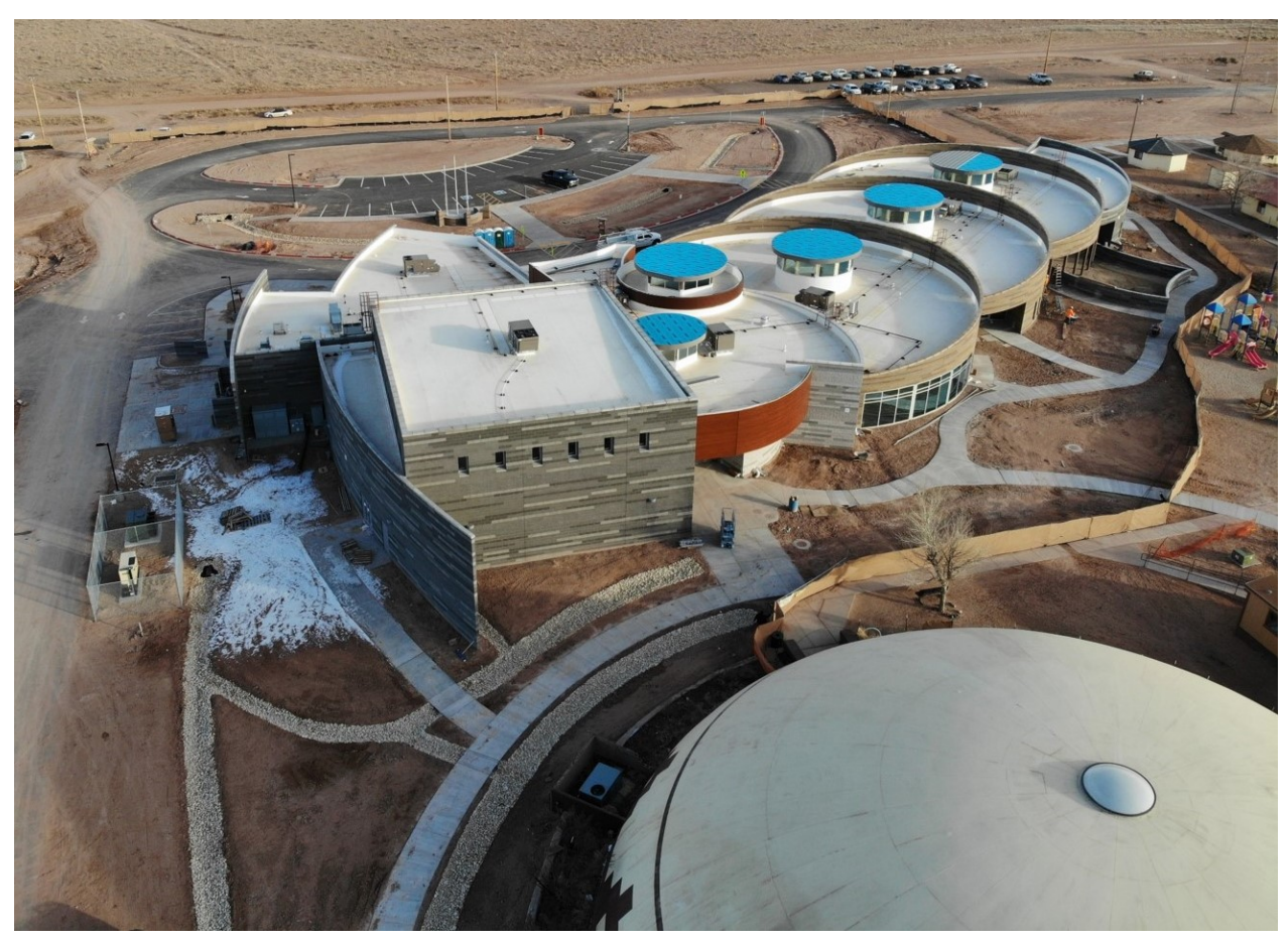
Little Singer Community School in Birdsprings, Arizona

The final schools from the 2004 list under construction are the Beatrice Rafferty School (following construction completion, the school will be renamed Sipayek Elementary School) and Cove Day School. As of January 2020, 8 of the 10 schools from the 2016 school replacement list (Laguna Elementary, Quileute Tribal School, Blackwater Community School, Dzilth-Na-O-Dith-Hle Community School, Lukachukai Community School, Greasewood Springs Community School, T'iis Nazbas Community School, and Chichiltah-Jones Ranch Community School) are funded. Of the funded schools, one school has awarded their Design-Build contract, four schools are in the Design-Build contract process, and three schools are drafting Space Allocation Agreements.