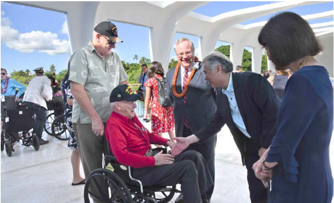
Secretary Bernhardt at the USS Arizona Memorial, December 7, 2019

Fixed Costs —Fixed costs of $3.7 million are fully funded.