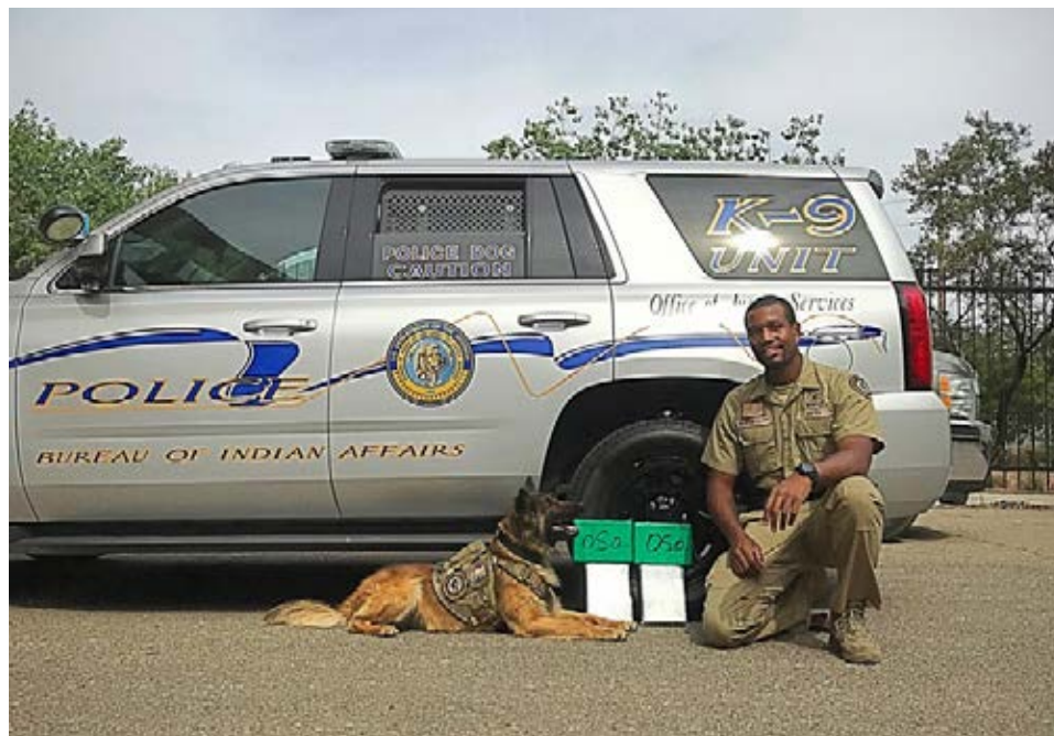
BIA-OJS Officer and his K-9 with seized heroin

The 2021 budget includes $423.7 million for Public Safety and Justice activities, of which $390.4 million directly supports 191 law enforcement programs and 96 corrections programs run both by Tribes and as direct services. The budget proposes to expend $20.0 million for drug enforcement efforts, strengthening the response to an observed increase in drug activity on Indian Lands. Drug-related activity is a major contributor to violent crime and imposes serious health and economic difficulties in Indian communities. Funding continues to support BIA drug enforcement agents and interdiction programs to reduce drug trafficking and drug-related crime. BIA will also continue to partner with Tribes, the Drug Enforcement Agency, and the Federal Bureau of Investigation to address drug-related activities, enabling BIA to better align, leverage, and coordinate with other