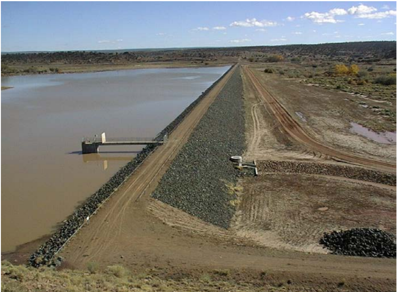
BIA-managed Ganado Dam—Navajo Nation

Contract Support Costs —The President’s budget maintains the Administration’s support for the principles of Tribal self-determination and strengthening Tribal communities across Indian Country by fully funding Contract Support Costs. Contract Support Costs enable Tribes to assume responsibility for operating Federal programs by covering the costs to administer the programs. The 2021 budget for the Contract Support Costs