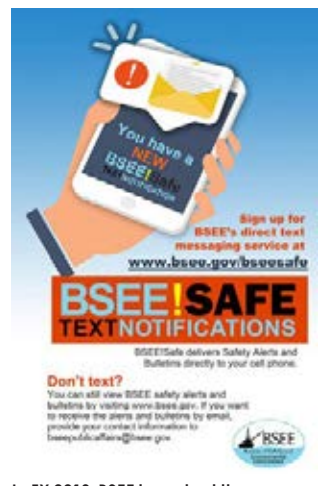
In FY 2019, BSEE launched the BSEE!Safe program to bring critical safety information directly to offshore workers on the Outer Continental Shelf through the use of text messaging notification technology.

Consistent with its 2019–2022 Strategic Plan, BSEE is implementing key management tools focused on strong and smart programs and processes moving forward. BSEE is working to improve and streamline processes; ensure the efficient use of resources within BSEE; enhance development opportunities for the workforce; and integrate effective