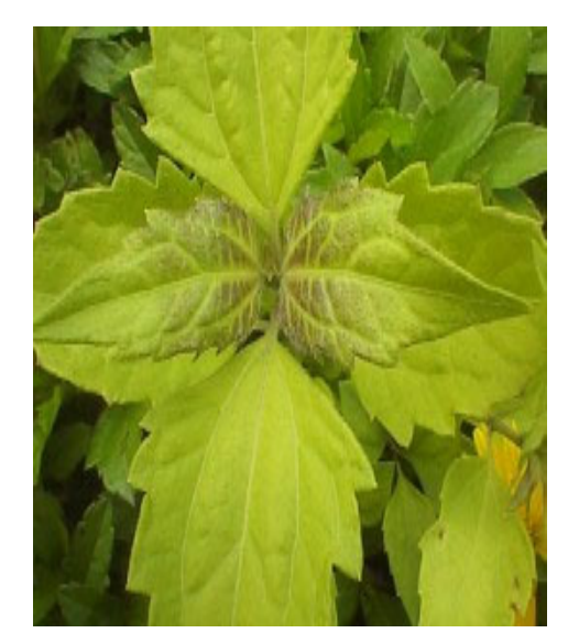
Chromolaena odorata near Ganta, Nimba County

In addition to the problem of C. odorata ;