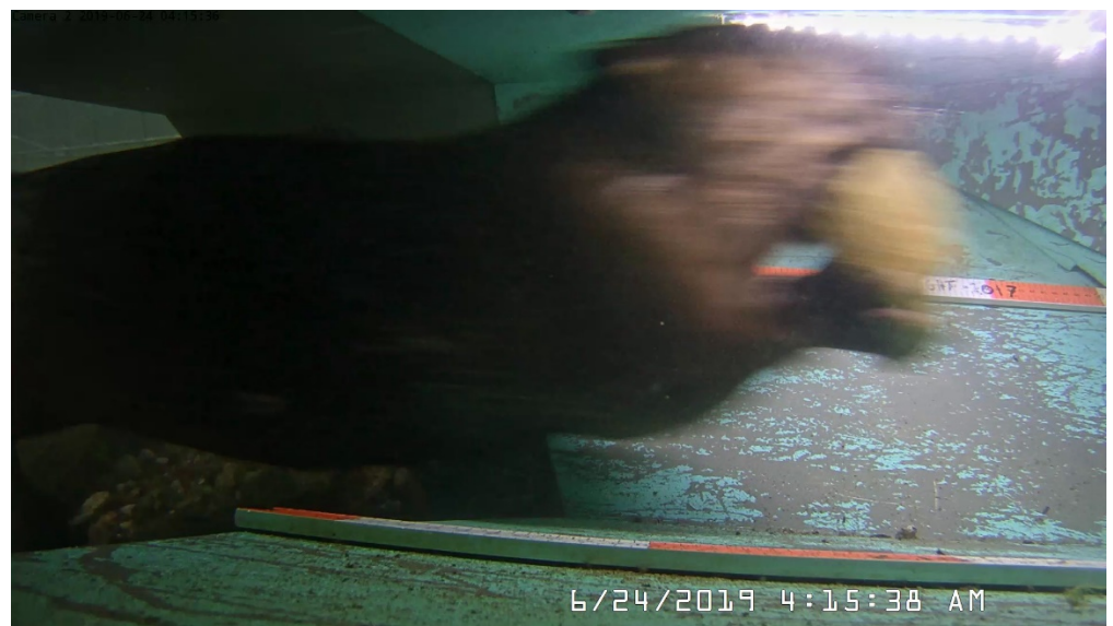
Figure 2. Video capture of a beaver carrying a rock through the Neva Lake video weir, 24 June, 2019.