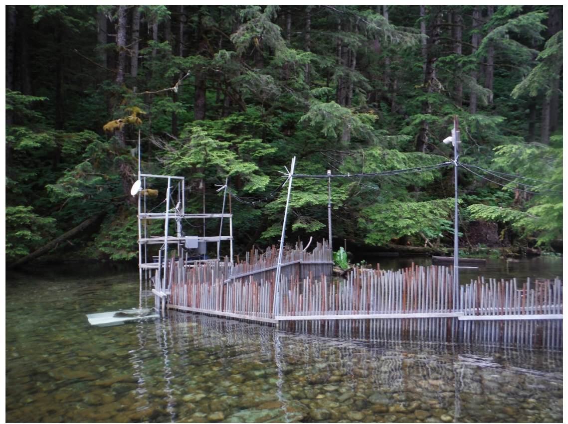
Figure 1. The remotely monitored video weir at Neva Lake, near Excursion Inlet.

Viewers can see underwater views of the video chute, site views from the surveillance cameras, and view recent motion-triggered clips.