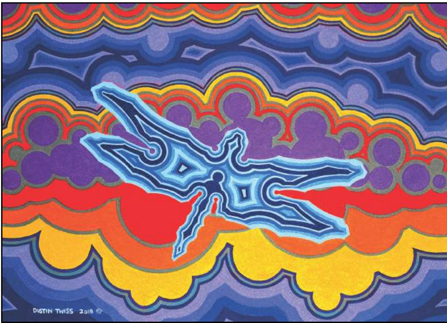
Dragonfly Sunset Colored pencils and ink on paper © 2018 Dustin Twiss