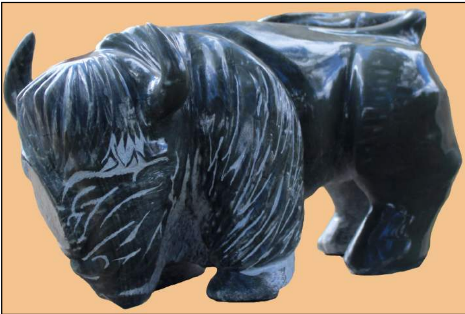
Bison Alabaster © 2018 Brendon Albers