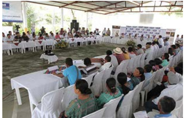
Meeting of the South Petén Roundtable, San Luis, Petén, Guatemala, March, 2014.

Promote Economic Alternatives: Support communities in the MBR and the Adjacency Zone with Belize with honey and “seed fund” alternatives.