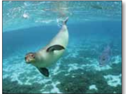
Images from Papahānaumokuākea: left to right on this page: dazzling corals and reef fish, Hawaiian monk seal and a red spined urchin.

Indigenous cultural connections to the sea are additional attributes to the globally significant natural resources of Papahānaumokuākea.