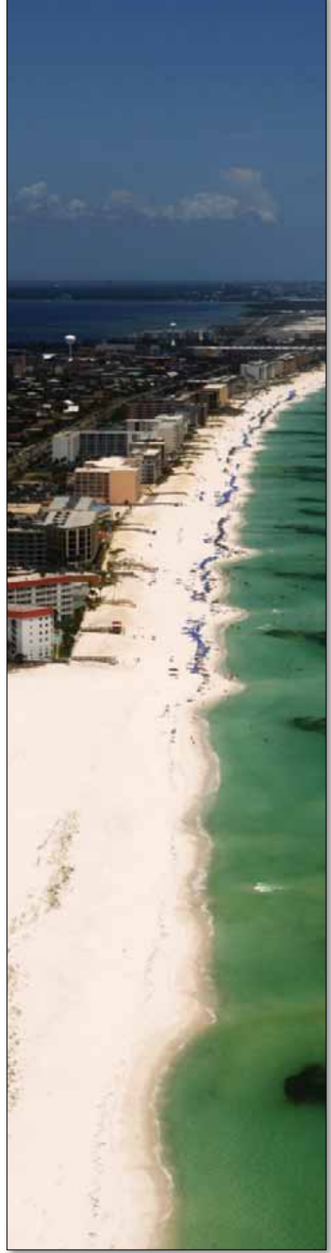
Bird's eye view of the coastline along the northern Gulf of Mexico, Santa Rosa Island, FL.