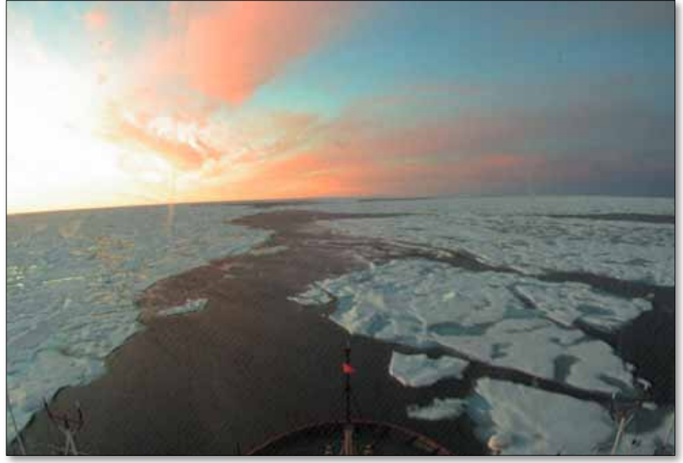
An image from the Arctic Ocean. The view of ocean, ice and sky across the horizon, as seen from the U.S. Coast Guard Cutter Healy on August 8, 2010.

http://www.whitehouse.gov/files/ documents/2010stewardship-eo.pdf