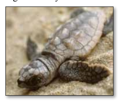
Loggerhead hatchling hits the beach.

Scientists from the U.S. Fish and Wildlife Service, the Florida Fish and Wildlife Conservation Commission, the National Park Service and NOAA devised the rescue plan rather than risk the hatchlings encountering oil as they entered the Gulf of Mexico. Sea turtle