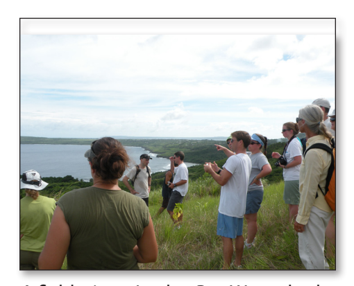
A field trip to Laolao Bay Watershed highlighted watershed conservation projects to protect the coral reefs.

Learn more about the Coral Reef Task Force: http://www.coralreef.gov/