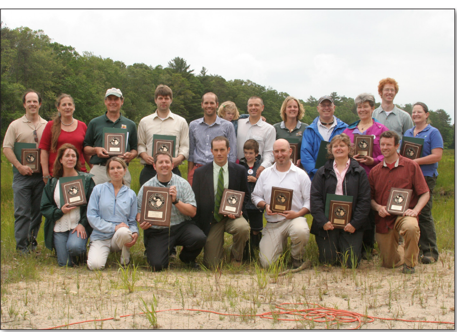
The newly restored Eel River headwaters. Recipients of the Coastal America Partnership Award.