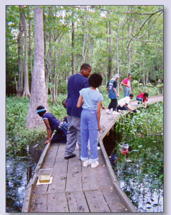
Boardwalk trails allow visitors access to the swamp's underwater world. Here students explore with dip nets.

Jean Lafitte National Historical Park and Preserve includes six sites: