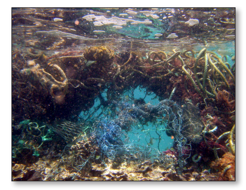
Fish-eye view of floating plastic marine debris.

Watch the video here: http://www.vimeo.com/24321624