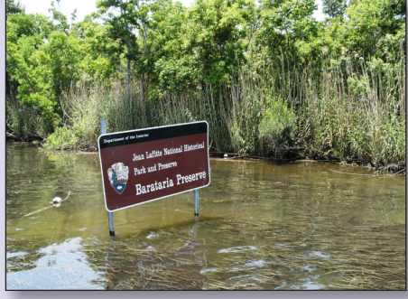
The Preserve sign welcomes the visitor to the watery world of the Barataria Preserve.