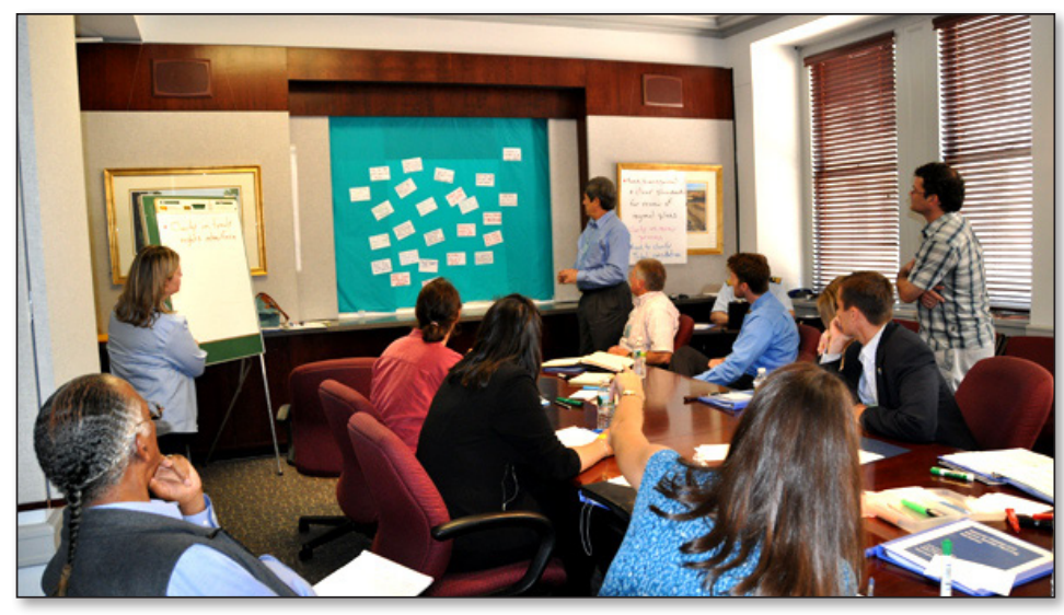
Smaller groups met together with facilitators and experts to discuss issues and conduct simulation CMSP scenario exercises.

The workshop was part of a growing conversation among our part-