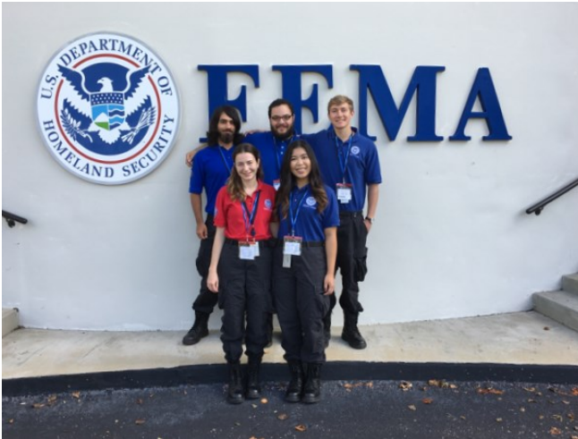
FEMA Corps team Summit 2