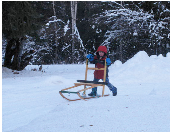
All photos courtesy of the UHM Center on the Family, except child in snow and by river courtesy of Ronald Standlee Strom.