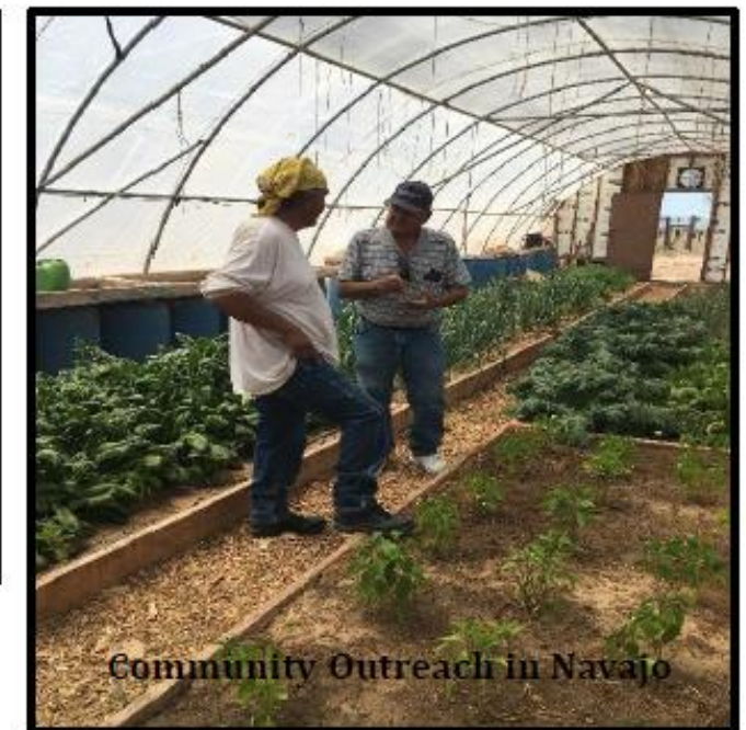
Community Outreach in Navajo