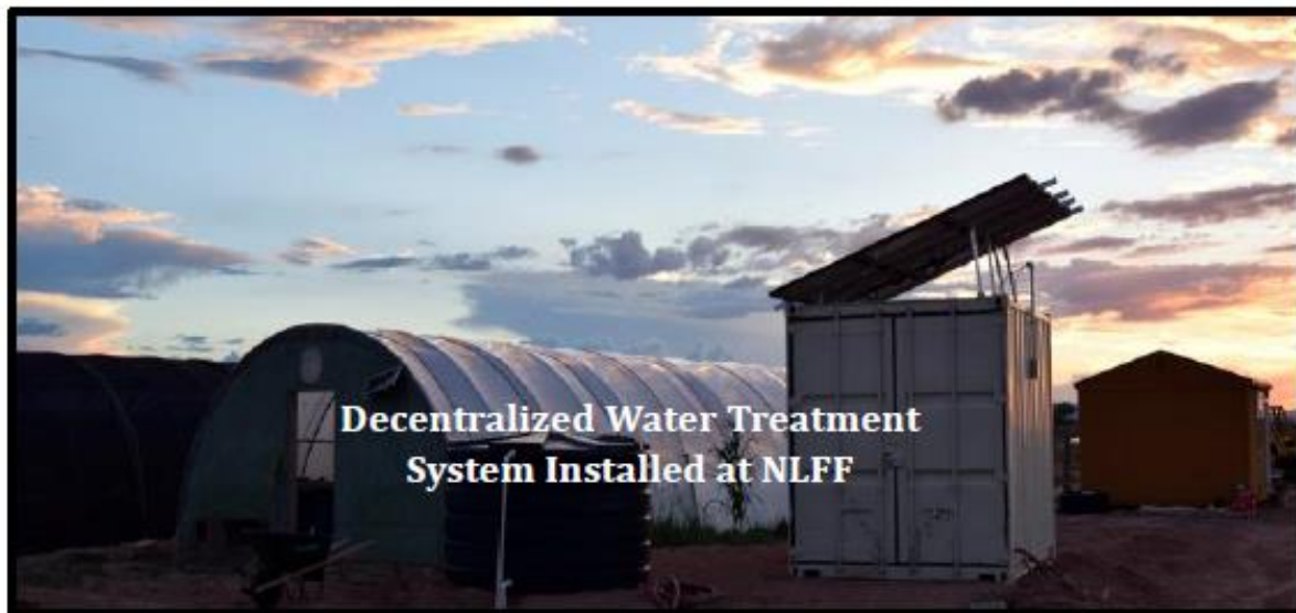
Decentralized Water Treatment System Installed at NLFF