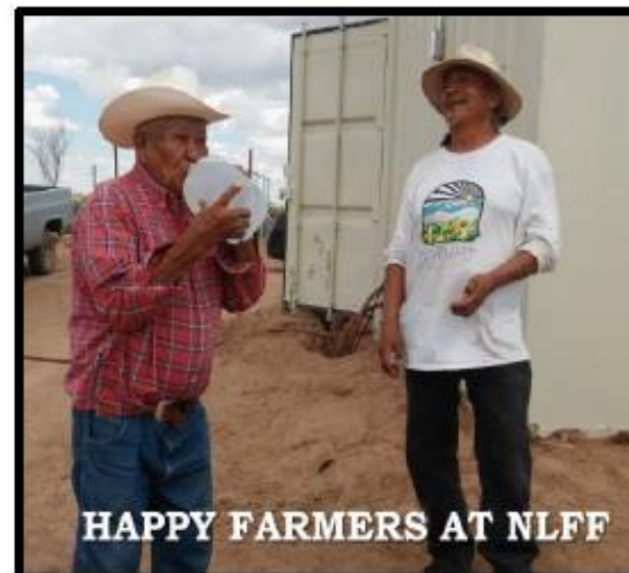
HAPPY FARMERS AT NLFF