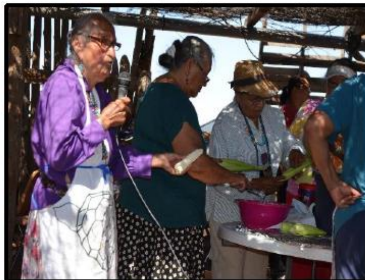
Community Food Education in Navajo