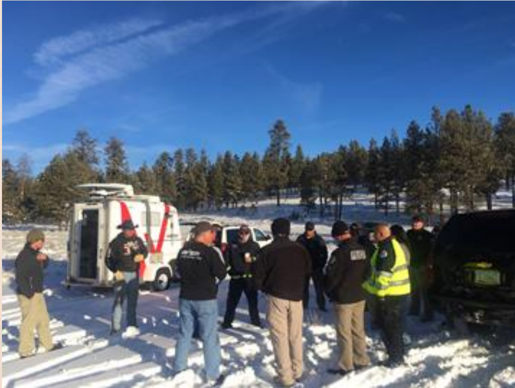
Hualuapai Tribal Police