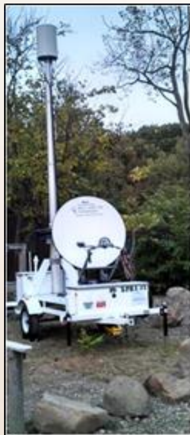
SPOT Satellite Pico-cell on a Trailer