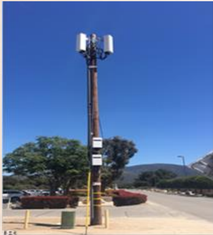
Pechanga Reservation Small Cells services the Tribal Offices, health center, and Pechanga Fire Dept., Tribal Park . There are 4 more planned to service the remote homes on the reservation.