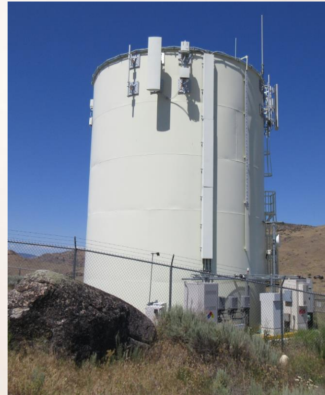
Colville Tribe Water Tank Macro Collocation services the reservation areas.