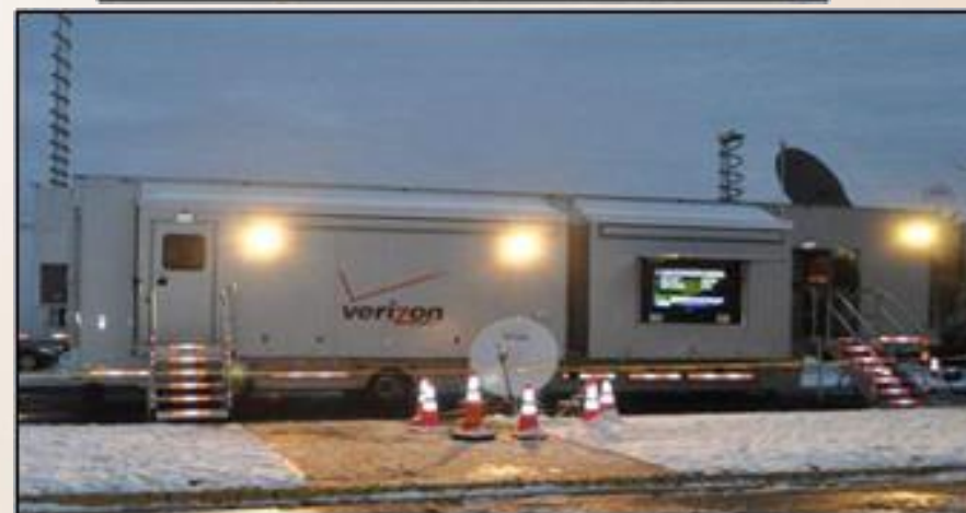
Mobile Incident Command Post