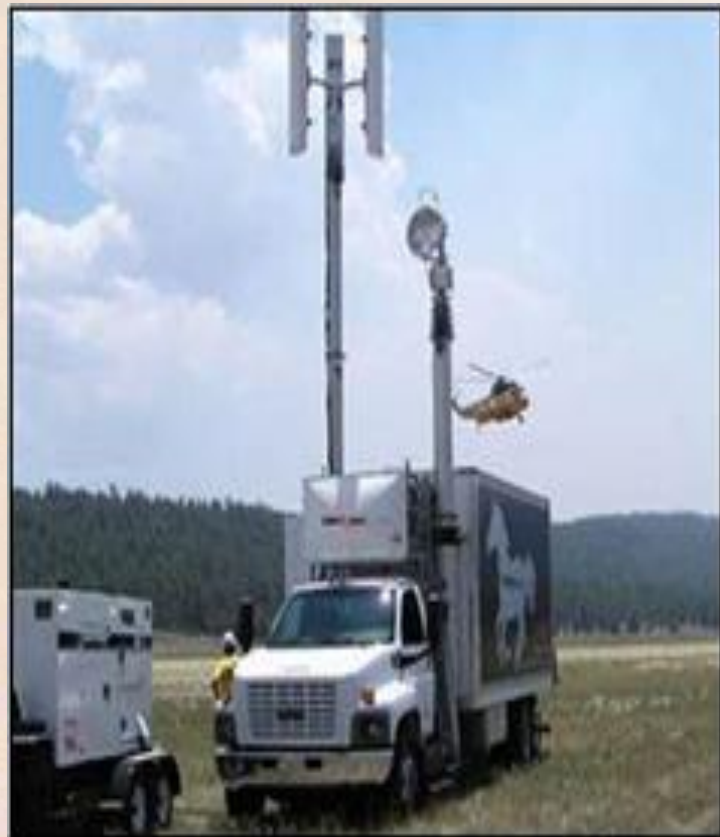
Temporary Cell on Wheels (COW or COLT)