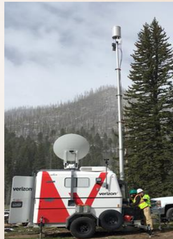
Mobile Connectivity Trailer Pueblo of Santa Clara, NM