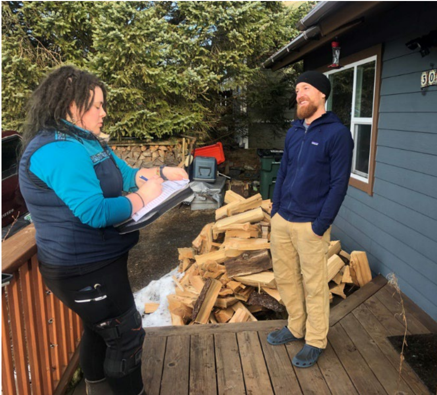
ADF&G staff conduct a subsistence survey with a Kodiak resident, February 2022.

This presentation shares preliminary data that have been approved by the Sun'aq Tribe of Kodiak, but have not yet undergone a full community review. Draft data are being presented to inform KARAC decisions on FP23-05a and cannot be distributed until draft findings are approved by the Kodiak community.