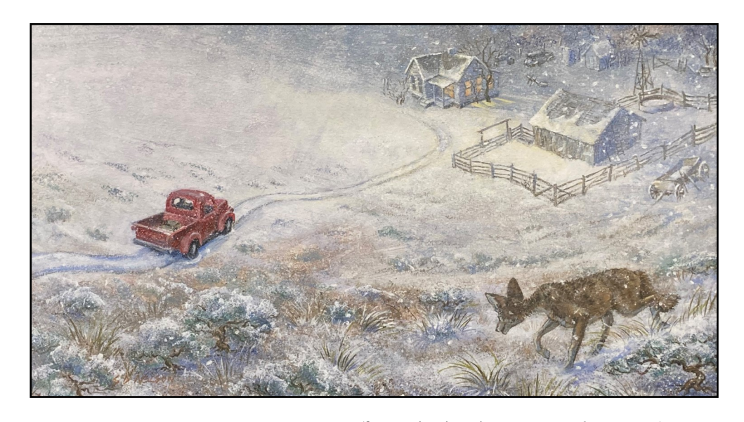
Ranch House, Red Pickup Truck, (from the book Coyote Christmas) Acrylic on paper © 2007 S.D. Nelson