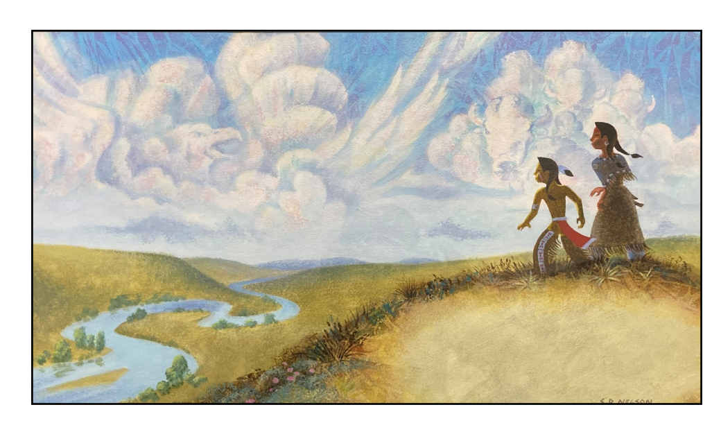
Cloud People I (from the book The Star People ) Acrylic on paper © 2003 S.D. Nelson