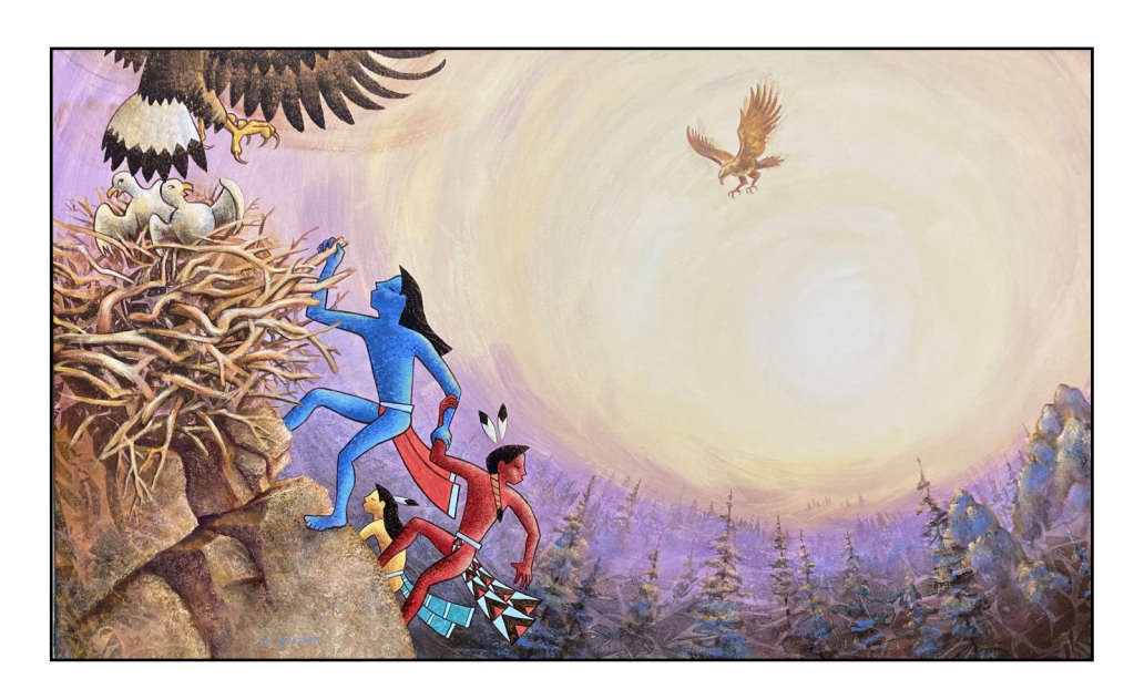
Crazy Horse's Vision (from the book Crazy Horse's Vision) Acrylic on board © 2000 S.D. Nelson