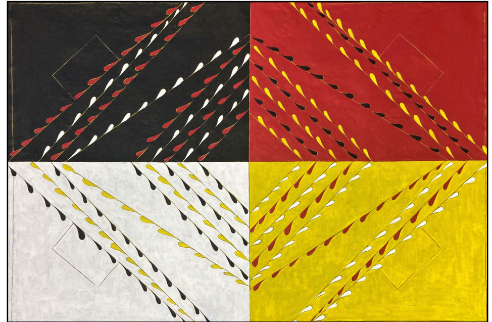
Mixed Blood Acrylic on linen cloth © 2019 Andrea Lekberg