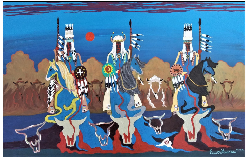
Blood Skull Warriors of the Red Earth Oil on canvas © 2016 Ernest Marceau