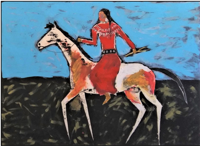
Rides a White Horse Woman Linocut painting © 2018 David Dragonfly