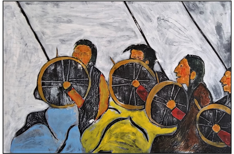
Singers of the Sacred Songs Linocut painting © 2018 David Dragonfly