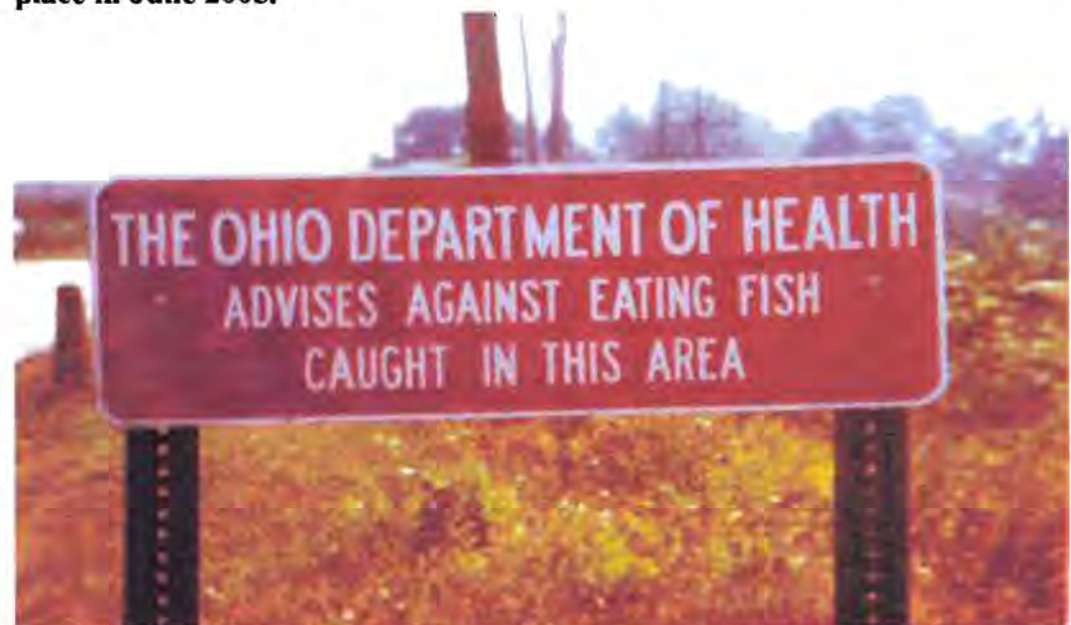
Figure 1. Fish Advisory Sign Located on the Ashtabula River. This Sign was in place in June 2005.

posted along the Ashtabula River (Figure 1). Because fish have unrestricted access, and move freely between Fields Brook and the Ashtabula River, data from both Fields Brook and the Ashtabula River have historically been used in establishing fish consumption advisories for the Ashtabula River. (Regan Williams, Ohio EPA, per. com.).