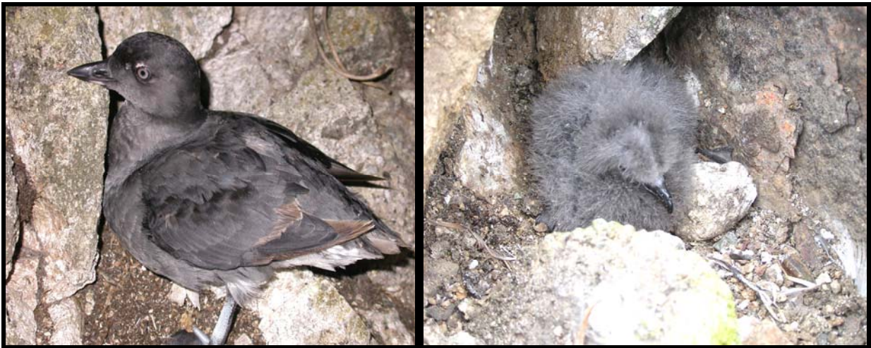
Cassin's Auklets (at burrow entrance, left) and Ashy Storm petrels (right) have benefited from this project. Invasive weeds cleared from nesting crevices and burrows allow Cassin's Auklets to find burrow entrances and enable nestling petrel chicks to flourish.