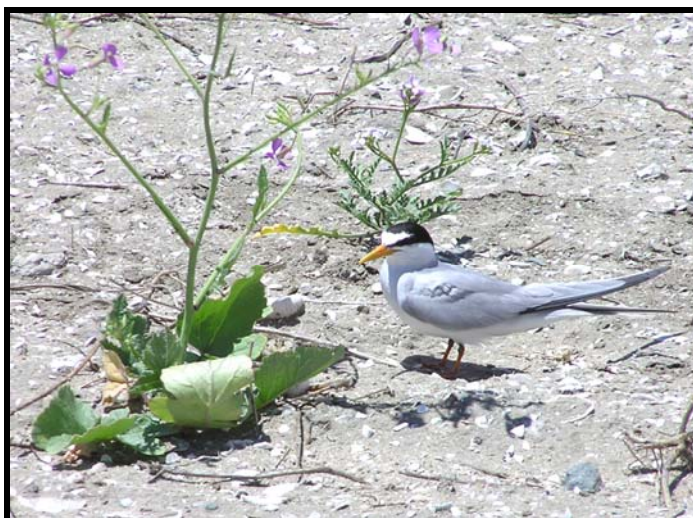
California Least Tern on new substrate.

This project has created new nesting habitat at Alameda Point for the endangered California Least Tern by enlarging the nesting area and installing protective fences. The newly created habitat is being monitored by removing undesirable vegetation, repairing protective fencing, and adding nesting substrate where needed.