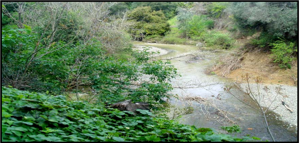
Riparian restoration through removal of invasives and planting native vegetation.