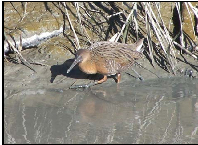
Expanded foraging area available for clapper rail after invasive Spartina control.

Habitat® herbicide, with the active ingredient imazapyr, was used for all control work in 2007. In July through September 2007, the fourth consecutive year of control work was conducted in the Southeast San Francisco Sub Areas, totaling 2.0 acres of non-native Spartina treatment. In addition, the third year of consecutive treatment was conducted at two sites: West San Francisco Bay (Site 19) and Alameda/San Leandro Bay (Site 20), totaling approximately 150 acres.