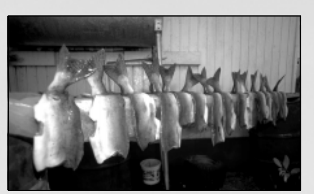
Salmon drying on a rack in Old Harbor

people who traditionally subsist on the fish, wildlife and plants of the region could no longer trust what they were eating and turned instead to high-priced groceries. Recreational opportunities were mostly shut down and the world-wide image of an attractive and pristine Prince William Sound was tarnished with oil.