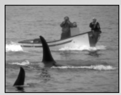
Researchers identify killer whales by their dorsal fins.

The AB pod of killer whales, which lost 13 of 36 members in the two years following the oil spill, has yet to regain its former size, even though the overall size of the Gulf of Alaska population has