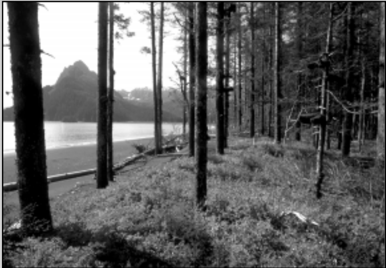
Approximately $25.1 million has been set aside for a long-term habitat fund.

Because complete recovery from the oil spill may not occur for decades, and because healthy habitats are essential to the permanent recovery of the spill region, the Council has taken steps to extend its comprehensive restoration program beyond September 2001, when Exxon makes its final settlement payment. By unanimous resolution in March 1999, the Council set aside $55 million of Restoration Reserve funds to continue its effort to protect key habitats. The $55 million will be split between $29.9