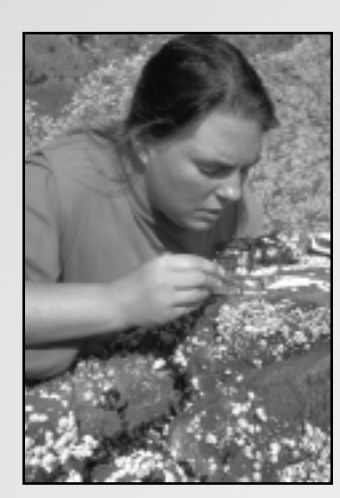
Monitoring the recovery of intertidal organisms.

Intertidal and subtidal communities are well on their way to recovery, but recovery has generally been lagging in the upper intertidal zone. Subtidal communities include such species as eelgrass, starfish and helmet crabs that remain nearshore but underwater at