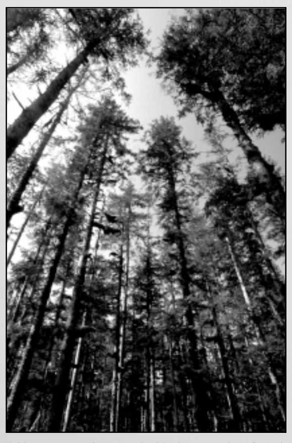
Habitat programs have resulted in the protection of nearly 650,000 acres in the spill region

Roughly $25 million in Restoration Reserve funds have been earmarked for continuing the program beyond 2002, as described earlier.