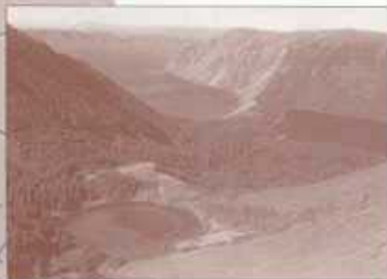
View from a ridge overlooking Pillar Lake and Seal Bay in Afognak Island State Park. The Trustee Council purchased lands on Afognak Island in 1993 to protect habitat important to resources injured by the spill. Governor Hickel dedicated the area as Afognak Island State Park in May 1994.

The Trustee Council has supported a coded wire tag program for several years as part of its efforts to restore pink salmon. Use of information obtained in 1994 from coded wire tags helped ensure that wild pink salmon streams in the spill-affected areas of Prince William Sound met their spawning escapement goals (the