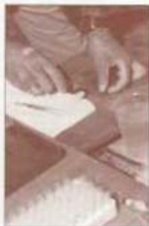
An Alaska Department of Fish and Game field biologist prepares tissue from a Russian River sockeye salmon for genetic tests. Samples of muscle, liver, heart and eye tissues were prepared and stored in liquid nitrogen, then transported to the laboratory for analysis as part of a genetic stock identification project to aid in managing sockeye in lower Cook Inlet fisheries.

By collecting and measuring pristane in mussels each year, scientists may be able to obtain a simple indicator of marine productivity.