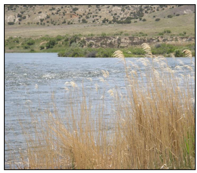
Bureau of Land Management