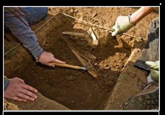
Archaeologists recover faunal remains from a site

<sup>7</sup>For decades archaeologists have captured information from animal remains recovered at archaeological sites. Since the presence of certain kinds of remains can provide information about a site's habitation and environment, the remains are often used to comment on the occupation and environmental conditions of the site at which they were found. For instance, female white tailed deer give birth in the spring; if a site contains only mature deer bones (those with fused ends) one can infer that the site supported a wholly adult population, probably in the fall or winter. However, the presence of both immature bones (those with un-fused ends) and mature bones suggests that the site supported a combination of young and adult deer, most likely in the spring or early summer. ( continued p. 2 )