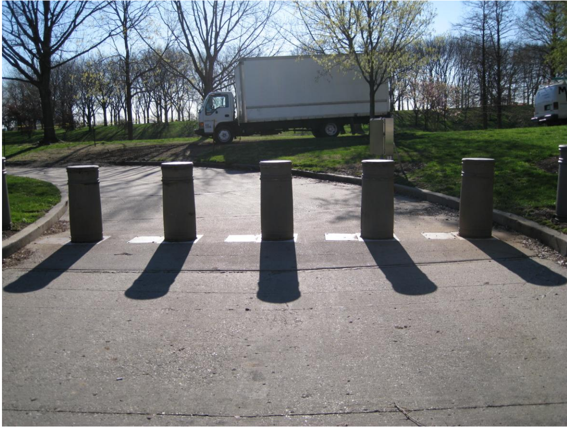
Photo No. 3 Vehicle Barrier on Memorial Drive adjacent the Old Cathedral