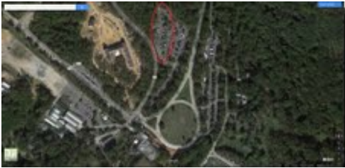
Closed Mount Vernon Parking Lot.jpg