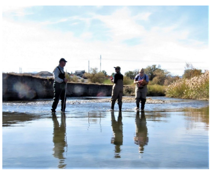
Community Scientists collect river cross-section measurements

Once completed, the <u>Big Bend Nature</u> <u>Park</u> will become one of the "gems" of the Jordan River, providing quality