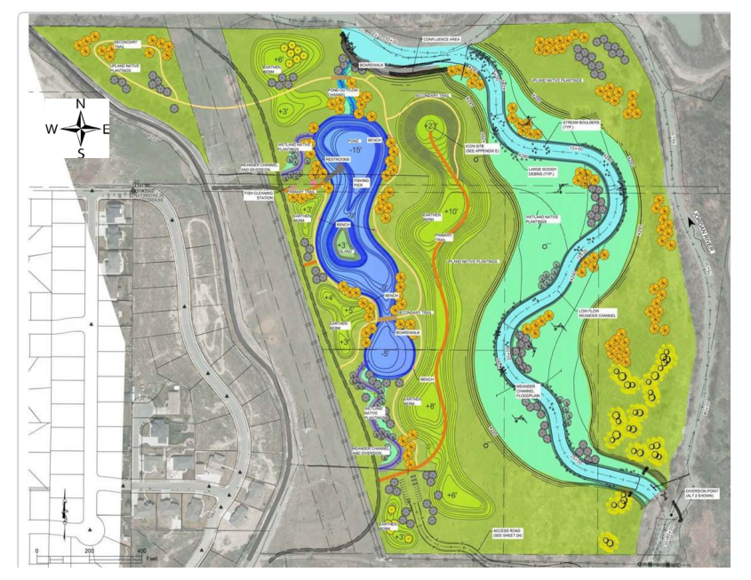
Big Bend Restoration Project Conceptual Plan. Existing river channel is on the east and north boundaries of the property, Jordan River Trail is on the western boundary. Elevated viewing hill located between pond (dark blue) and inset floodplain (aqua)

below the level of the floodplain. This disconnected the river from the floodplain, resulting in the loss of native riparian vegetation and replacement by more drought-tolerant exotic and noxious plant species that do not provide the same habitat quantity and quality to neotropical migratory birds and other wildlife.