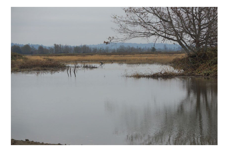
Blue Heron Slough after dike breaching event

As part of a Natural Resource Damage Assessment & Restoration settlement, nearly 350 acres of estuary and upland habitat at Blue Heron Slough, along Interstate 5 in the Snohomish River estuary, have been restored. Dikes have been breached, reconnecting this habitat critical to salmon, bull trout, and migratory birds to the Snohomish River watershed and Puget Sound for the first time in nearly 100 years.