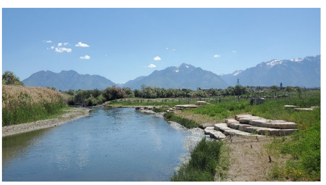
Restored Jordan River bank and public access point, Big Bend Nature Park, West Jordan, Utah

In 1995, the City of West Jordan, a community near Salt Lake City, set forth a vision for a large urban nature park in the heart of the Salt Lake Valley. This vision was laid out in a proposal to FWS to restore natural resources injured by the Sharon Steel and Midvale Slag CERCLA ("Superfund") sites. The location they chose to become the "<u>Big Bend Nature Park</u>" was a 70acre parcel of land located between the Jordan River, which runs through the Salt Lake valley connecting Utah Lake to the south with the Great Salt Lake to the north, and the Jordan