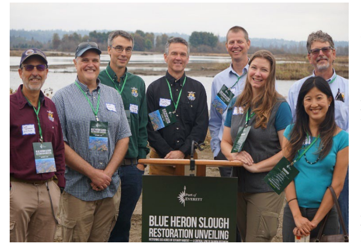
U.S. Fish & Wildlife Service staff at the unveiling for the restoration of Blue Heron Slough near Everett, WA on September 1, 2022

T he restoration work was partially funded through a consent decree with Port Gardner Bay Trustees, who agreed to address legacy pollution around the former site of a Weyerhaeuser paper mill and other areas in Port Gardner Bay. The Port Gardner Natural Resource Trustee Council included the Department of the