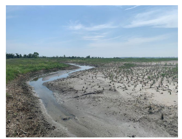
Same area in July 2022 showing the native plantings and the regrowth.

After years of planning and fundraising, the $4.65-million effort to restore 34 acres of salt marsh and adjacent upland areas at Great Meadows Marsh broke ground in November 2021. The project cost included $808,000 from three NRDAR cases in Connecticut: Lordship Point, Raymark Industries, and Housatonic River RCRA Site plus $75,000 from ORDA. General Electric Corporation was responsible for contamination of the Housatonic River from its source in Pittsfield, Massachusetts, to where it meets Long Island Sound just east of Great Meadows Marsh. Lordship Point Gun Club and Raymark Industries Superfund sites are also at the mouth of the river. These case settlements supported planning and engineering, and leveraged funds for the project construction and future monitoring. Using settlement money to restore the marsh to benefit fish, wildlife and people helps compensate for environmental impacts associated with these sites.