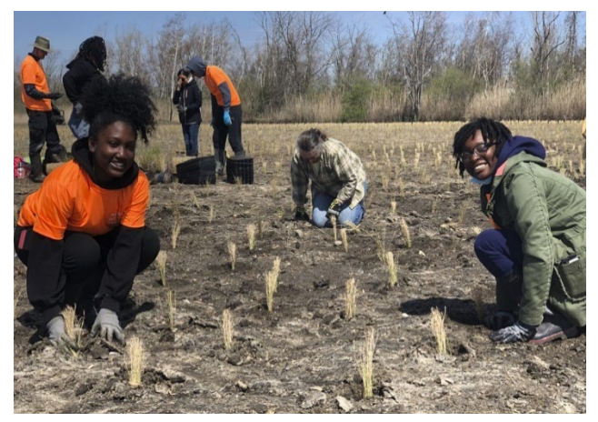
Salt Marsh Stewards plant spikegrass and saltmeadow cordgrass alongside volunteers during the week of Earth Day 2022.

Once the site was cleared of common reed and modified to suit tidal flow and wildlife, volunteers, local high school students, contractors, and project partners planted more than 165,000 grasses and other nonwoody plants. The high school students participated through Audubon Connecticut's first-ever "Salt Marsh Steward" program. In partnership with the Town of Stratford, they hired 12 local high school students to plant marsh vegetation. Participants gained work experience while learning about salt marsh conservation and interacting with other students, volunteers, community members, and conservation professionals.