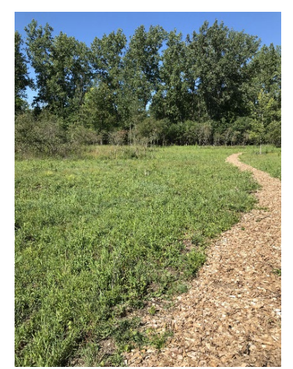
A nature trail through the newly restored pollinator area at Eagle Ridge.

determine the extent of injuries to natural resources and the services they provide as well as the amount and types of restoration needed to make the public whole for losses over time. The Trustees for the site are the State of Michigan, represented by the Department of the Environment, Great Lakes, and Energy, the Department of Natural Resources, and the Department of Attorney General; the Saginaw Chippewa Indian Tribe of Michigan; and the U.S. Department of the Interior, represented by the U.S. Fish and Wildlife Service and the Bureau of Indian Affairs.