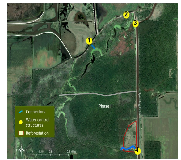
Ferguson Bayou re-connection from Spaulding Drain

<u>Wildlife Refuge:</u> Using funds from the settlement, the Shiawassee National Wildlife Refuge (Refuge) created a new connection channel and installed four water control structures to restore flow through the Ferguson Bayou area of the Refuge. Ferguson Bayou is a paleo-channel of the Flint River that had been disconnected from river flows for many decades. This project reconnected the Ferguson Bayou to the Flint River flow via Spaulding Drain and thus increased the hydrologic connection from the Flint River/Spaulding Drain system to thousands of acres of floodplain within the Refuge. This project allows more flow and connectivity for fish and other aquatic organisms through this system. The