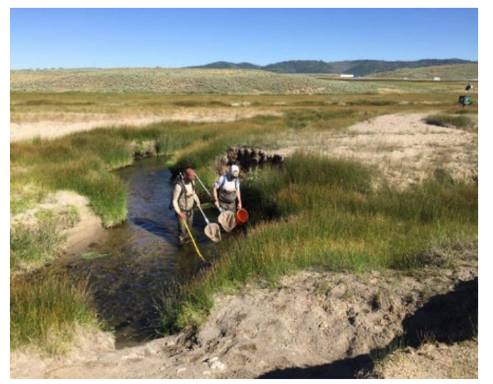
Field biologists surveying for fish in Silver Creek amidst mine tailings at the Richardson Flat Tailings Superfund Site, UT

Damage assessment cases are conducted by one or more of the resource management bureaus within the Department: Fish and Wildlife Service, National Park Service, Bureau of Land Management, Bureau of Indian Affairs, and Bureau of Reclamation. Support for economic analysis is provided by the Office of Policy Analysis; scientific and technical analysis and support is provided by the U.S. Geological Survey; and the Office of the Solicitor provides legal counsel. In nearly all cases, the Department's assessment activities are carried out in partnership with other Federal, State, and/or Tribal co-trustees. These partnerships have proven advantageous, as cooperation, consultation, and collaboration amongst the trustees facilitates addressing multiple resource management concerns across different levels of governments and consolidates those concerns into a single case. Trustees can also share data, achieve economies of scale, avoid duplication of effort and minimize administrative burdens and expenses. Responsible parties also benefit, as they are able to address all trustee concerns in a single, unified case.