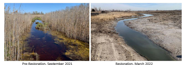
Water impounded on the invasive Phragmites marsh and high nuisance mosquito production

among Connecticut's most extensive remaining salt marshes, designated a "Globally Important Bird Area" by the National Audubon Society and BirdLife International. Once more than 1,400 acres in size, the marsh was reduced to half that area, and portions no longer functioned properly due to the addition of dredged soils, spread of non-native plants, and sea-level rise. The degraded marsh produced abundant mosquitoes that plagued nearby residents and visitors alike.