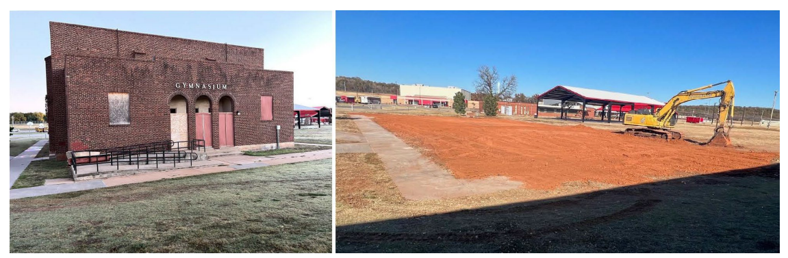
Riverside Indian School

Funds are used for space reduction activities in the education program. The asset portfolio and Space Management Plan (SMP), as derived from the DOI Asset Management Plan (AMP), contains a five-year space reduction plan, which is the vehicle for implementing the space goals through consolidation, colocation, and disposal of assets. The goal of space management is achieved by eliminating unnecessary space while maintaining facilities to meet mission-related needs. The SMP identifies BIE-owned assets nationwide which have been determined to be in excess of program needs and are not considered viable for continued use by consolidation or renovation. Subsequently, these assets have been designated for disposal via demolition or transfer.