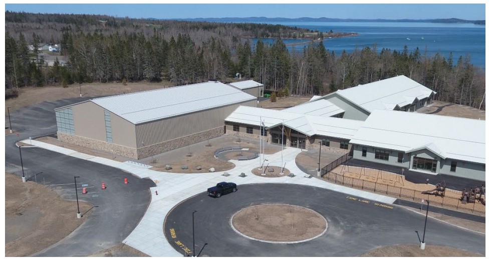
Beatrice Rafferty School