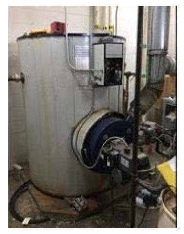
Boiler at Blackfeet Dormitory in Montana

The National Board Inspection Code (NBIC), first published in 1945 as a guide for chief inspectors, has become an internationally recognized standard, adopted by most US and Canadian jurisdictions. The NBIC provides standards for the installation, inspection, and repair and/or alteration of boilers, pressure vessels, and pressure relief devices. IA and DFMC have adopted the NBIC as well as other related national codes as part of its Boiler and Pressure Vessel Policy.