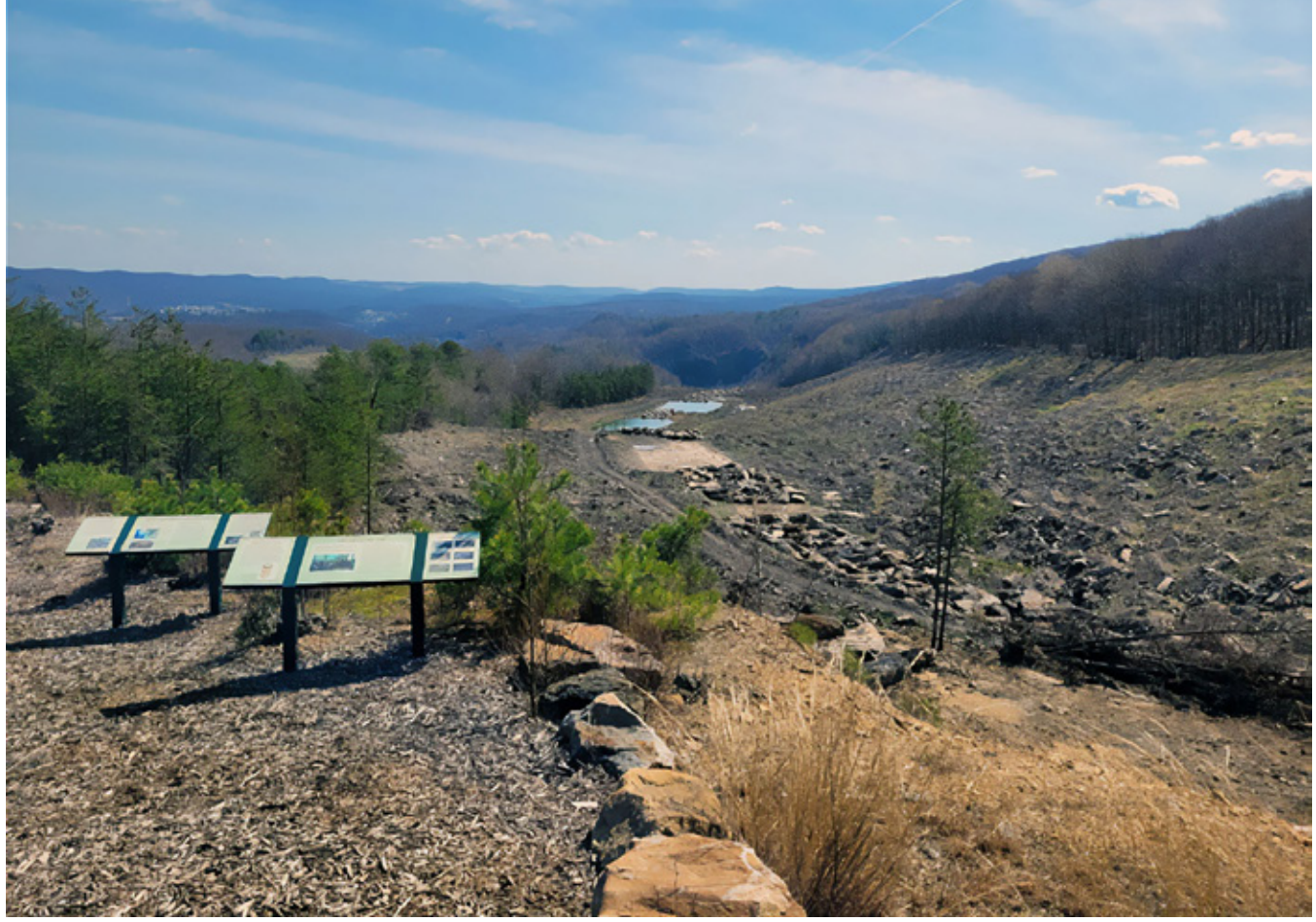
Anthracite Outdoor Adventure Area – Bear Valley Project.

The 2024 budget for the Abandoned Mine Reclamation Fund is $174.6 million, $5.7 million above 2023 enacted. This account derives a portion of its funding from a fee levied on coal produced for sale, use, or transfers and supports reclamation program functions carried out by the States, Tribes,