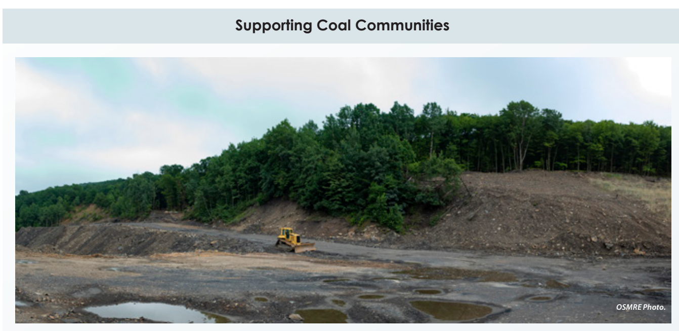
The Bipartisan Infrastructure Law provides $11.3 billion to accelerate and expand AML cleanup activities throughout the country. These funds will allow States and Tribes to close dangerous mine shafts, reclaim unstable slopes, improve water quality by treating acid mine drainage, and restore water supplies damaged by mining, while supporting vitally needed jobs in coal communities.

Collectively, these funds represent one of the most significant investments in the revitalization of America's coalfield communities since passage of SMCRA in 1977. Since the establishment of the AML Fund, OSMRE has distributed approximately $6 billion to States and Tribes for AML reclamation activities.