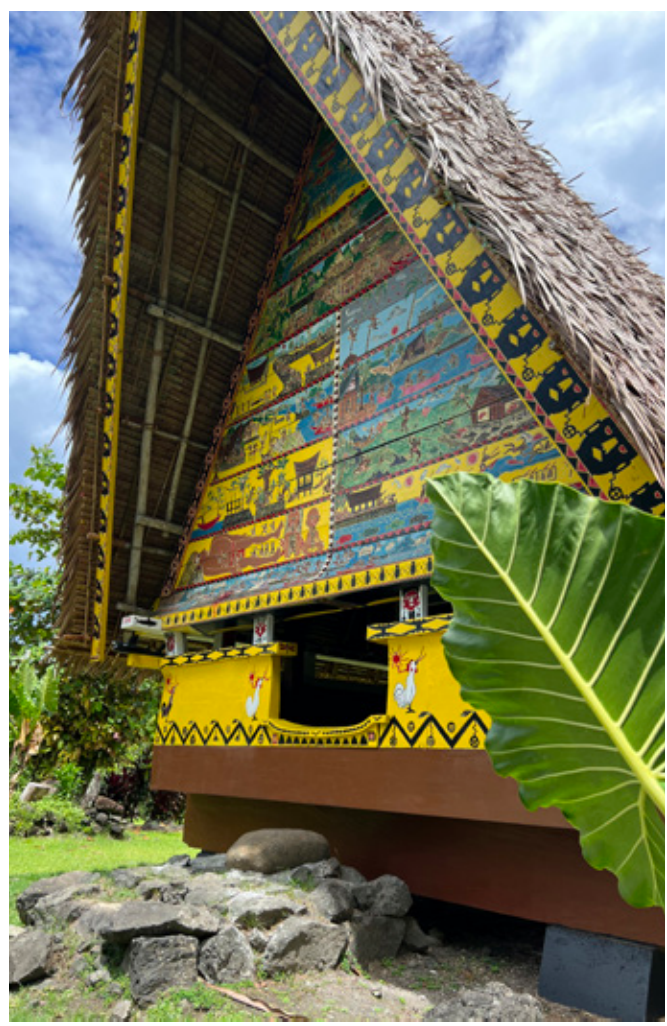
Traditional Men's House, Ngarachamayong Cultural Center, Koror, Palau

Most of OIA's annual budget consists of mandatory funding, including $239.2 million in 2023 to fulfill U.S. obligations under the COFA. Financial assistance under the COFAs is scheduled to end after 2023 for the FSM and the RMI and in 2024 for Palau. Financial assistance to the RMI under the Military Use and Operating Rights Agreement, which is permanently authorized and appropriated, will continue and is estimated to be $34.3 million in 2024.