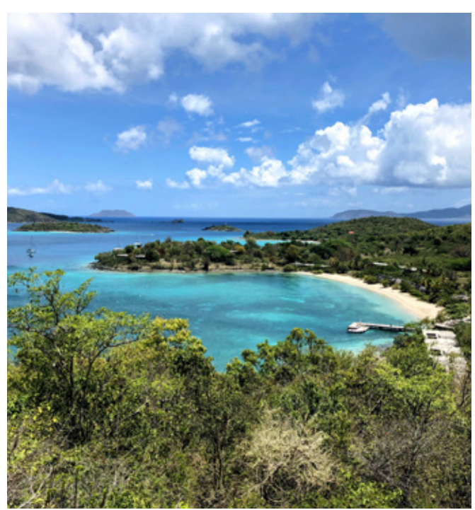
Caneel Bay, Virgin Islands National Park, U.S. Virgin Islands

The Department of the Interior looks forward to working with Congress on a Compact Impact Fairness Act. The Administration supports allowing Compact migrants to become eligible for key Federal social safety net programs while residing in the United States as a long-term solution to the financial impacts of Compact citizens on State and territorial governments. With mandatory