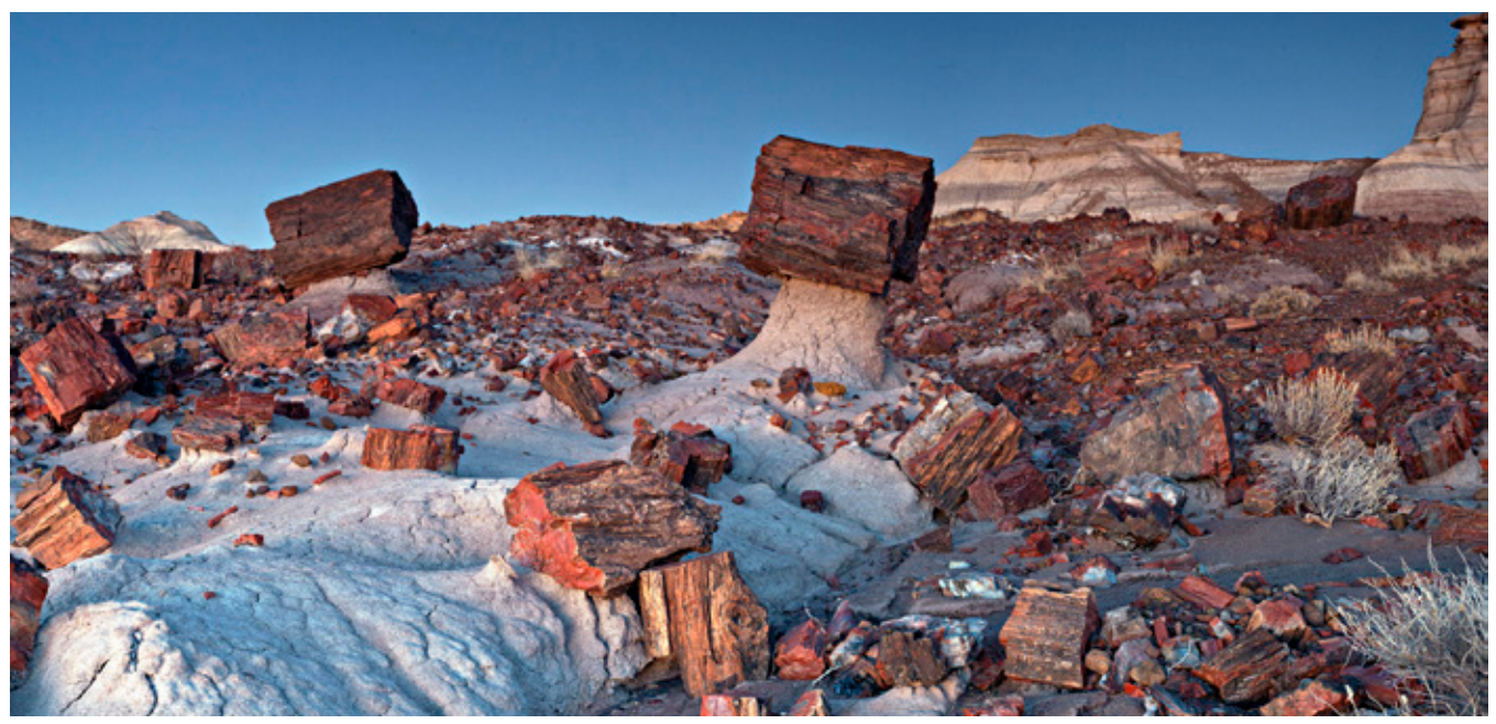
Petrified Forest National Park in Arizona.