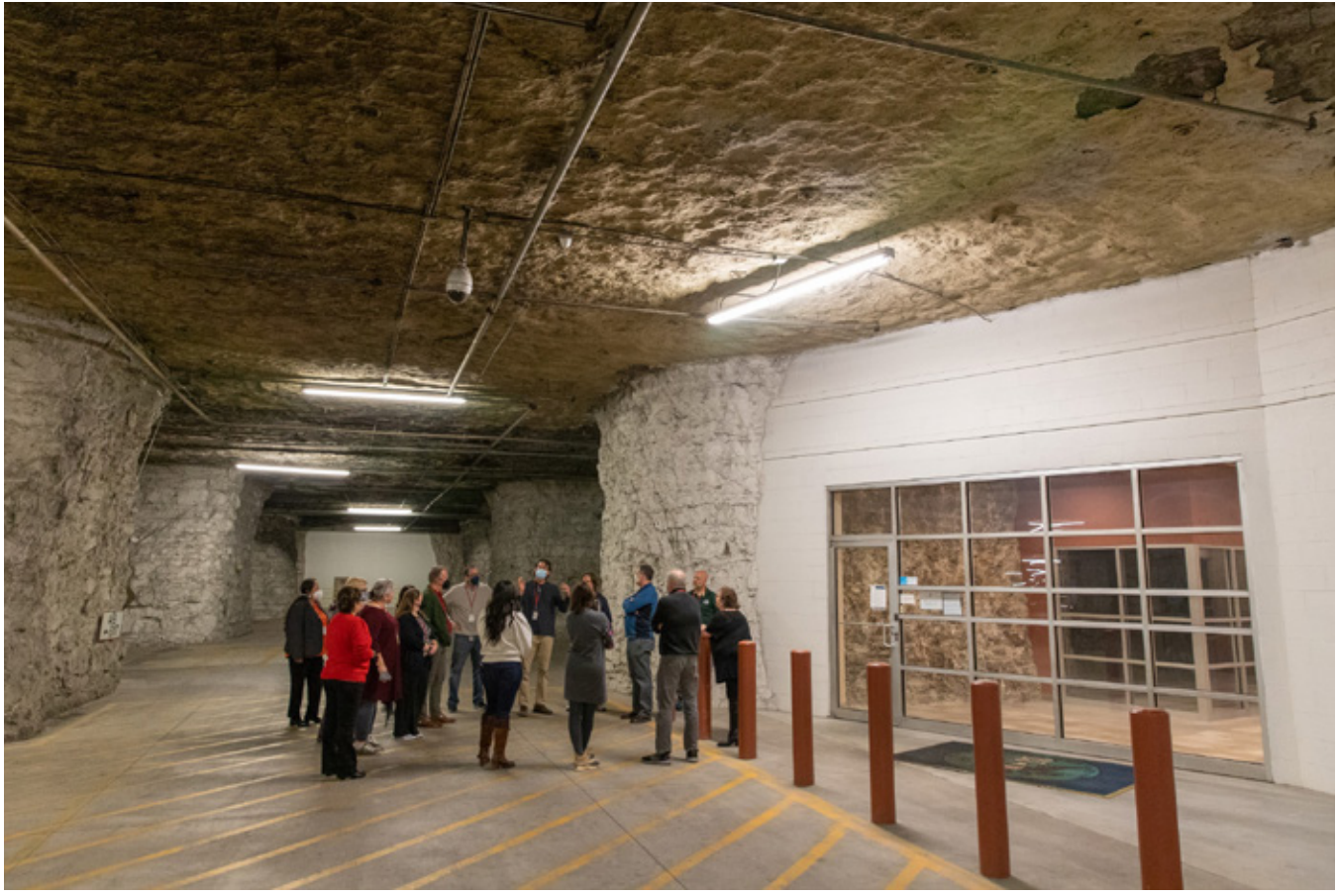
Entrance to the National Archives facility in Lenexa, KS.