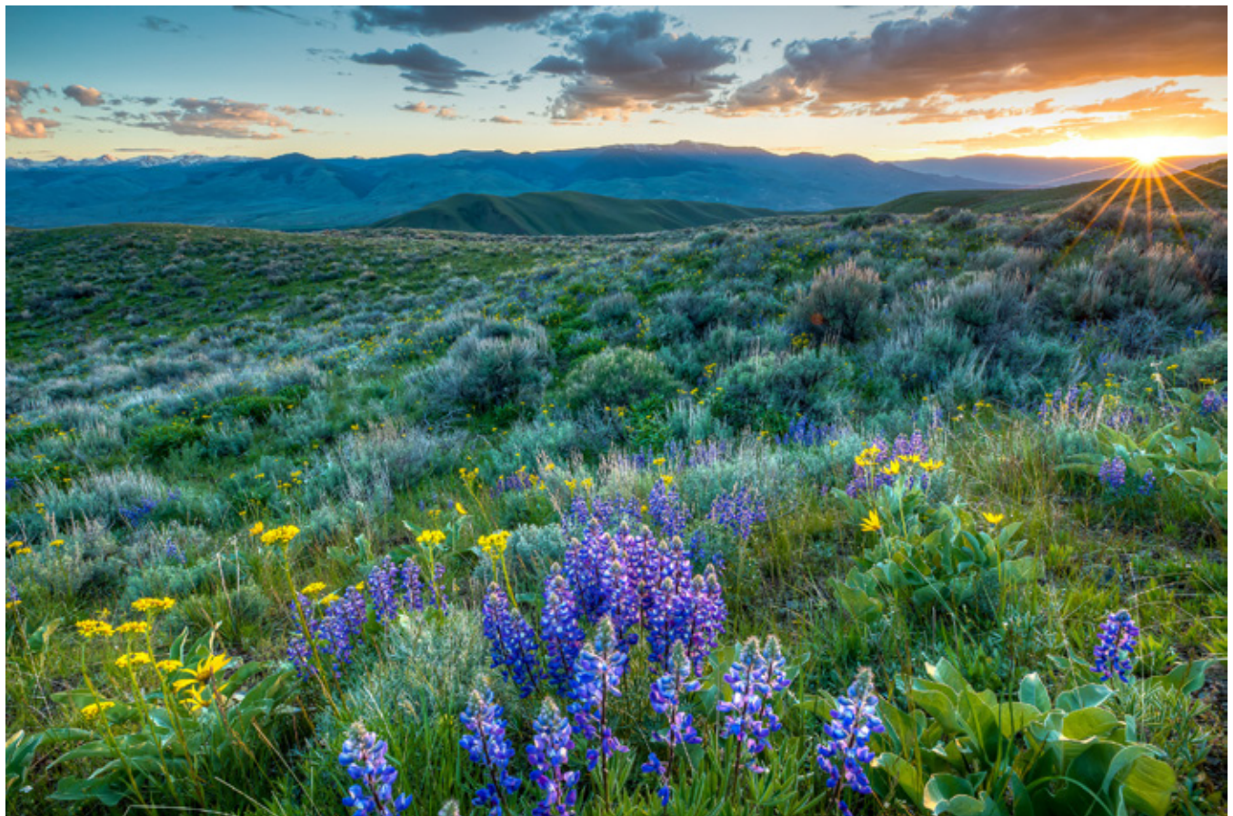
Lewis and Clark National Historic Trail in Idaho.

The budget request for Oil and Gas Inspection Activities is $51.0 million, $618,000 more than the 2023 enacted level. The requested increase will