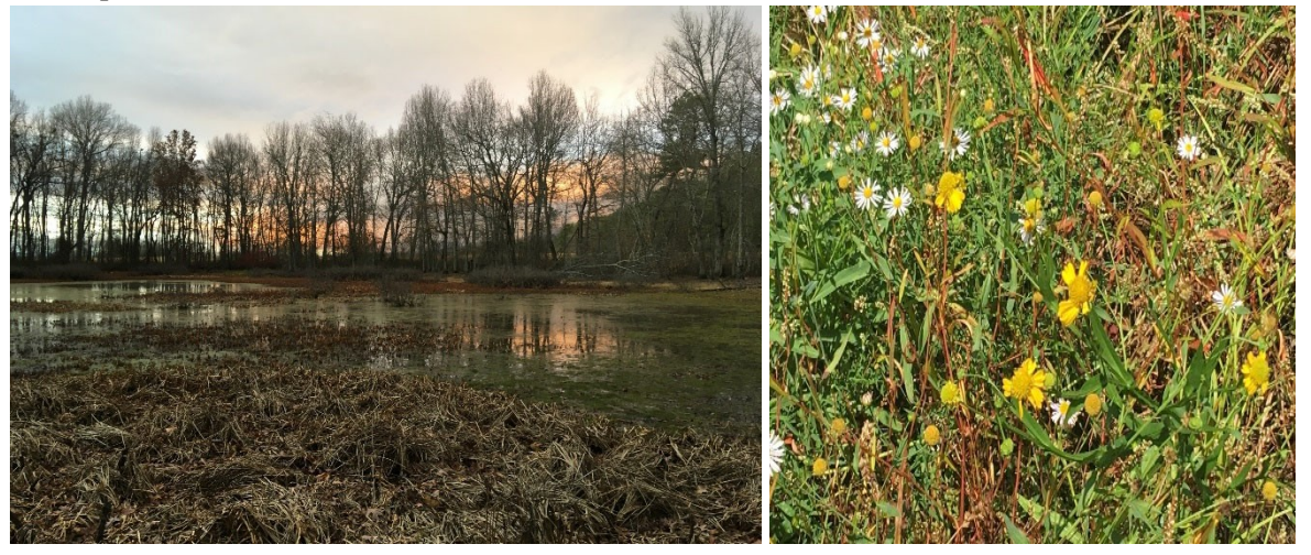
Sinkhole pond habitat at Lyndhurst Pond Natural Area Preserve (left). Virginia Sneezeweed and Mountain Doll's Daisy (right).

Additional acquisitions of land in 2020 included the creation of the <u>Cave Hill Natural Area Preserve</u> for which approximately 119 acres were acquired. The property contains historically significant caves that provide habitat for the federally-listed threatened Madison Cave Isopod as well as 78 acres of woodland habitat adjacent to the South River, and 41 acres of upland habitat that will be reforested and restored. Second, the creation of the <u>Lyndhurst Ponds Natural Area Preserve</u> for which approximately 350 acres were acquired. This site includes Shenandoah Valley Sinkhole Pond communities, forested habitat, headwaters streams, and habitat for migratory birds, mammals, amphibians, reptiles, plants, and federally and state-listed species, including Virginia Sneezeweed. The DuPont settlement will continue to fund restoration activities in subsequent years, including the creation of the <u>Dooms Acquisition/Recreational Fishing Access</u> for which 5 acres were acquired for the eventual creation of a new recreational fishing access point.