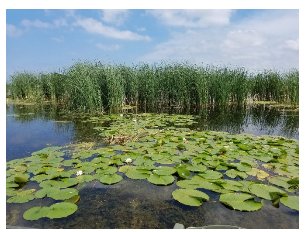
Side channel near the mouth of Duck Creek to the west of Ken Euers Nature Area.

Removed trees and brush have been repurposed for other habitat restoration projects in the area, a nod to the long-standing conservation practice of recycling. The nearly 117-acre area now welcomes those seeking a natural retreat close to home. Since the construction projects have concluded, more people are discovering the area's natural resources as a conservation treasure trove. More families are spending the day exploring under the cottonwoods and aspens. Photographers can line up incredible shots of Canada geese, ducks, pelicans, and herons. Anglers can drop a line in hopes of landing a bite, or at least a fish tale to tell their friends and family. Even the ambitious kayaker can put their boat in the Bay near the parking lot for an afternoon aquatic adventure.