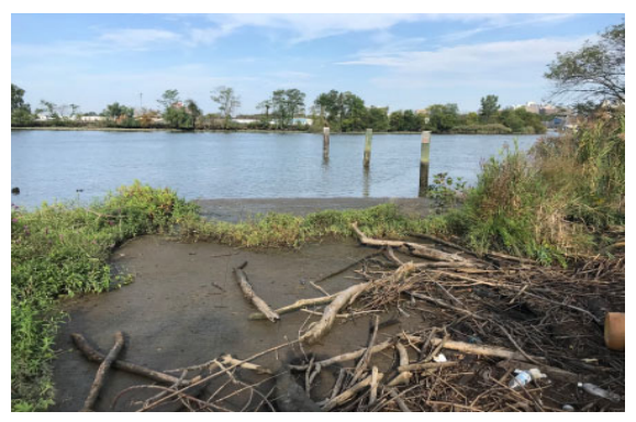
Future site of 7<sup>th</sup> Street boat ramp, located at the confluence of the Christina and Brandywine Rivers in Wilmington, DE. Implementation scheduled for 2021.

In 2020, the State and Federal trustees released an amendment to the Final Restoration Plan to relocate a planned boat ramp in order to expand