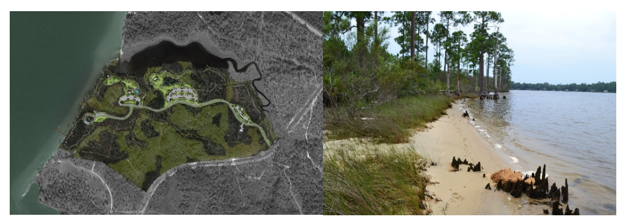
Lynn Haven Preserve and Park Project aerial (left) and shoreline (right).

The new public park located along the shore of North Bay and McKitchen's Bayou in Lynn Haven will provide public access to waterways and new recreational facilities, while also protecting rapidly disappearing habitat for the Panama City crayfish. Some of the other park amenities are more traditional and include an outdoor classroom, a two-story screened-in bay and bayou overlook, picnic pavilions, and a disc golf course. Dock access to the bay and bayou will be provided for kayaks and fishing and there will be dock access to motorized boats on the bay. A bayou boardwalk, trails, and wildlife viewing area will include interpretive signage, including information about the Panama City crayfish.