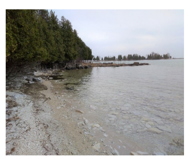
Detroit Island Shoreline.

A new tract of land just off the Door County peninsula was recently added to the Green Bay National Wildlife Refuge. The project contributed approximately 150 acres of land on the southern end of <u>Detroit Island</u> to the refuge. The nearly unspoiled coastal island has expanded protected critical habitat for fish and wildlife. This acquisition was a collaborative effort between FWS and the Herschberger family who have owned the land since the mid-1930s, with support from the Door County Land Trust. An initial survey noted a very diverse and unique assemblage of plants and animals living on the island. This new acquisition on Detroit Island is open for public use from Memorial Day to