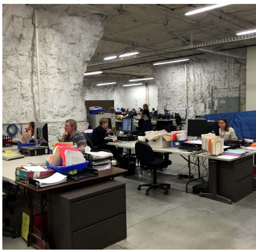
Research floor at the American Indian Records Repository.

The budget provides $13.0 million for Trust Records. This program operates the American Indian Records Repository and provides records management training and services to BTFA, Tribes, BIA, the Bureau of Indian Education, and AS-IA. Included in the request is $2.7 million for the digitization of trust records to continue ongoing work to meet new Federal records retention requirements and to modernize records operations.