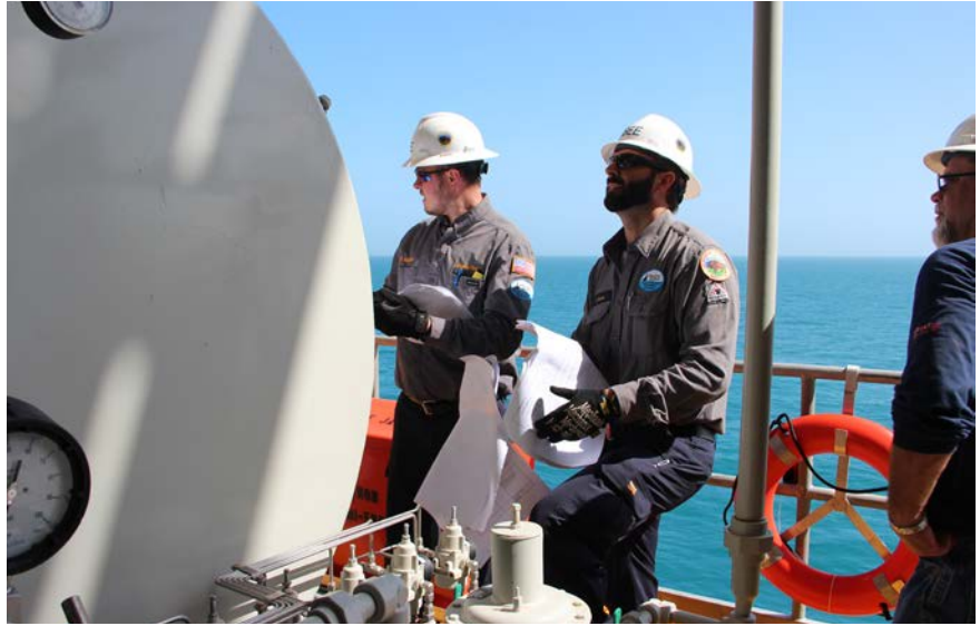
BSEE inspectors play a pivotal role in ensuring that offshore operations are conducted in a safe and environmentally sustainable manner.

Advancing Science—BSEE requests $4.8 million in 2022 to support renewable energy research. BSEE initiates, supports, and promotes science-based research to fulfill the bureau's mission through the identification and evaluation of critical energy equipment and technology. This process serves to reduce risk, support safe operations, and promote environmental stewardship on the OCS. Research is an essential component of the evaluation and decision-making process used to shape appropriate regulatory policies and practices within emerging programs. As renewable energy continues to rapidly expand along the Atlantic Coast, BSEE's renewable energy research will play a crucial role in ensuring national policies are scientifically