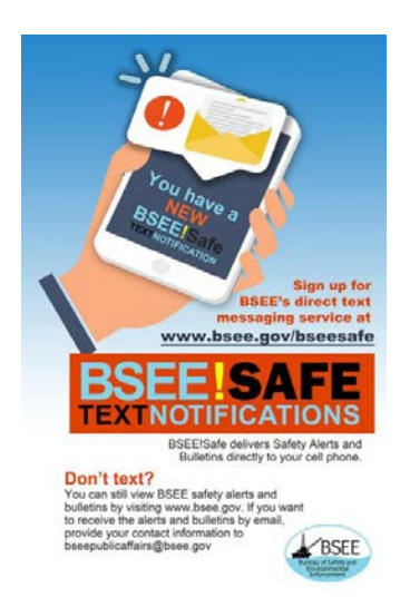
The BSEE!Safe program brings critical safety information directly to offshore workers on the Outer Continental Shelf through the use of text messaging notification technology.

BSEE's 2022 budget request fully supports the Administration's priority to tackle the climate