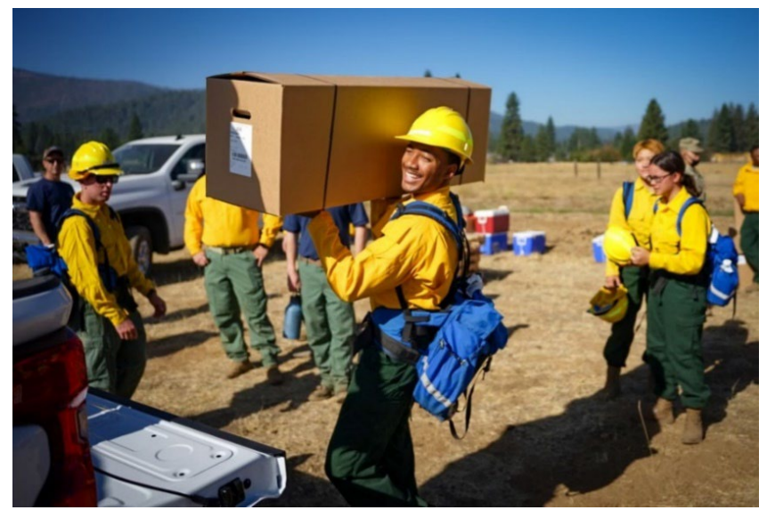
Photo 5. The BLM's Folsom Lake Veterans Crew trains Army personnel in wildland fire response on the 2021 Dixie Fire.

BIL funding also enables DOI to accelerate its Plan to Transform the Firefighting Workforce, initiated in 2021. Recent challenging wildfire seasons have focused attention on the increasing threat of wildfires to people, communities, and the natural environment. Yesterday's fire season is today's fire year . Shifting the current workforce toward more career appointments supports career growth and increases the retention of more experienced and knowledgeable firefighters. In turn, this will have a substantial long-lasting effect in support of more sound and robust management, decision-making, and safety for firefighters and the public.