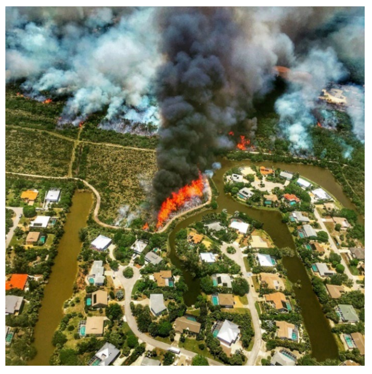
Photo 1. A FWS prescribed fire at the Darling National Wildlife Refuge in Florida.

DOI will continue to work with USDA to build partnerships, use existing resources, and invest in technologies and tools that are needed to better inform risk and empower stakeholders to make collaborative decisions that protect people, communities, and resources from the risks of wildfire. This will facilitate a collaborative, multijurisdictional approach to reducing wildfire risk over broad landscapes. Additionally, DOI will look for opportunities to