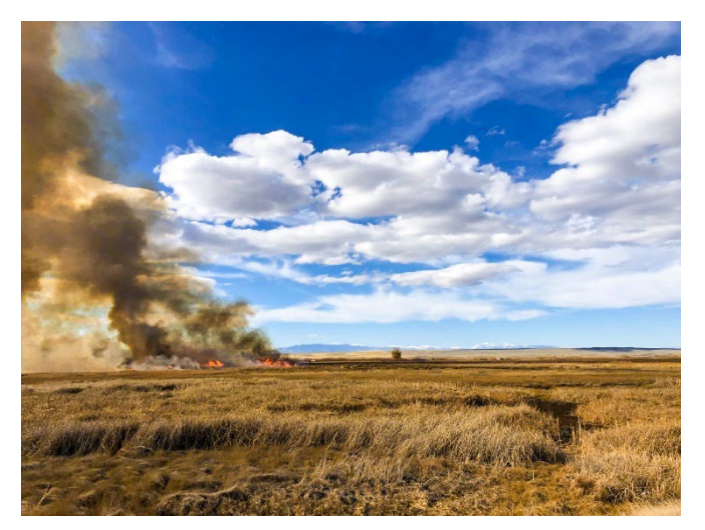
Photo 2. A FWS prescribed fire at the Camas National Wildlife Refuge in Idaho.

In FYs 2022 and 2023, DOI bureaus will use expanded three-year programs of work to identify projects consistent with program and BIL objectives. As described below, in subsequent years, DOI plans to continue developing and expanding the use of resources and tools to help guide bureaus and stakeholders in jointly identifying and planning multijurisdictional, landscape-scale projects that further support the goals and objectives of BIL.