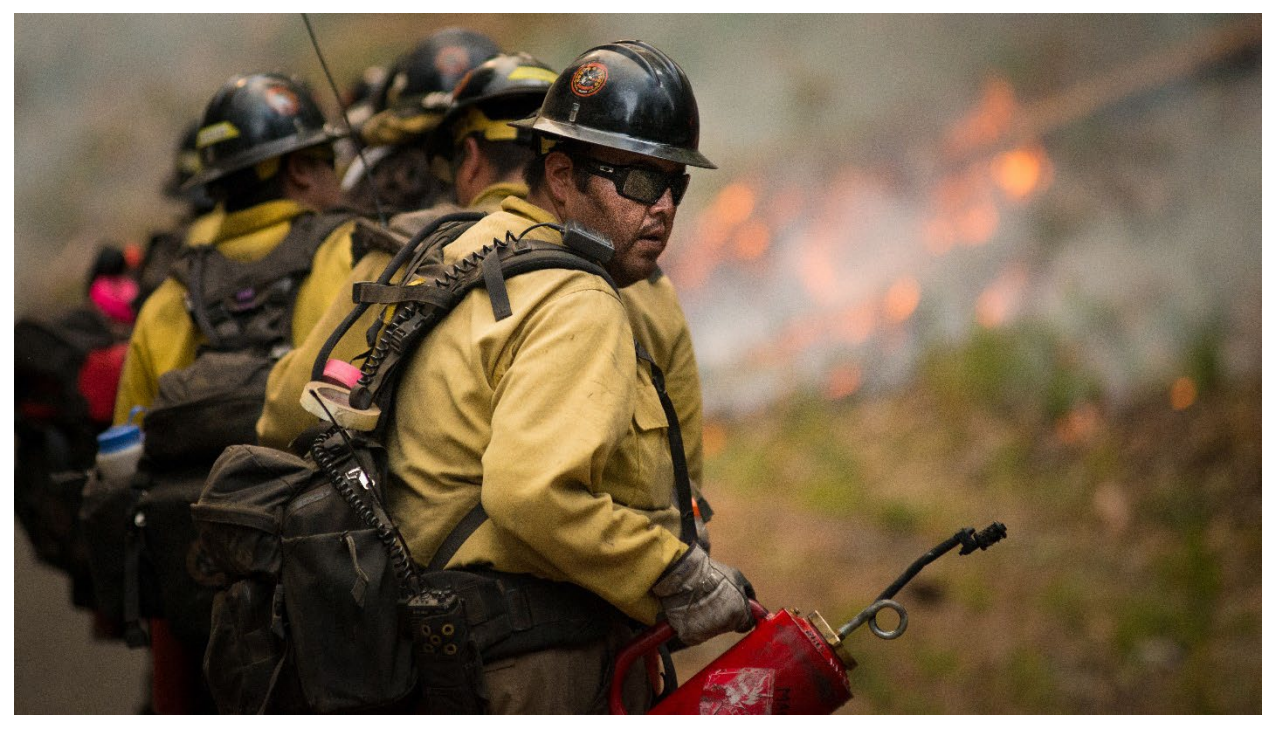
Photo 3. The Geronimo Interagency Hotshot Crew, administered by the San Carlos Apache Tribe, sets a prescribed fire.

In January 2022, DOI hosted a series of virtual consultation sessions with Tribal Nation leaders and Alaska Native Corporations. The feedback provided during the consultations highlighted the priorities and needs of Tribal Nations to protect their communities. Following up on these priorities is essential to ensure an efficient process for implementing BIL objectives on Tribal Nation lands.