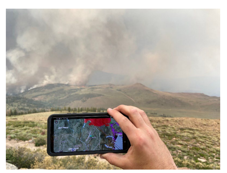
Photo 4. A mobile app enables wildland fire managers to track the locations of personnel and vehicles on the 2021 Tamarack Fire.

In addressing the fuels management needs described above, DOI will focus short-term efforts on those projects for which NEPA and other statutory review compliance have been completed, as directed by the BIL. In addition, leveraging USGS science and support, DOI will explore opportunities to create a NEPA Science and Support Team to provide direct scientific expertise to agencies by producing NEPA analyses; providing support to address other required natural, historic, and cultural resource analyses; and conducting literature reviews for hazardous fuel treatment planning activities. This will help ensure the most up-to-date state of the science is integrated into project plans.