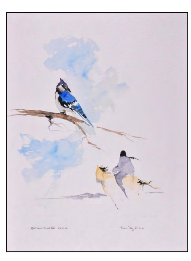
Blue Jay Rider (Zintkato gleglege Suntkakayanka) Watercolor on paper © 2019 Arthur Short Bull