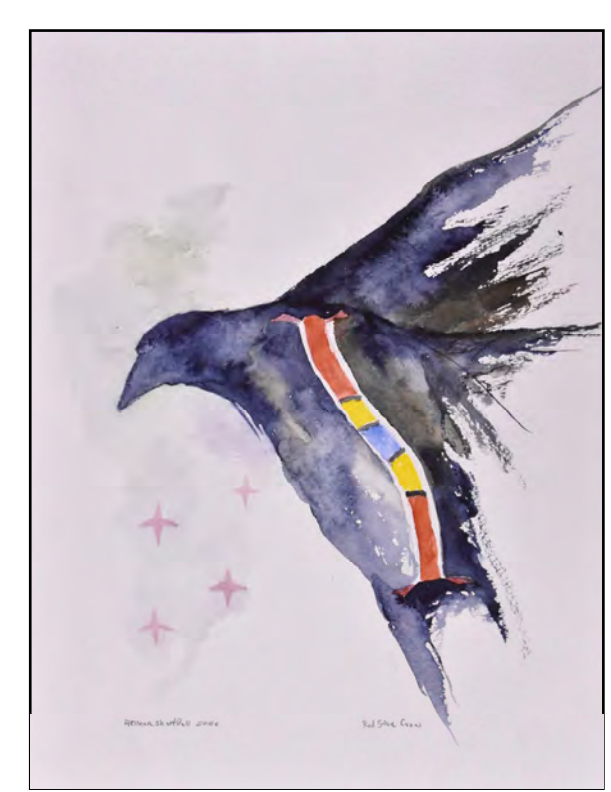
Red Star Crow (Wicapi Luta Kangi) Acrylic paint and mixed media on canvas © 2021 Arthur Short Bull