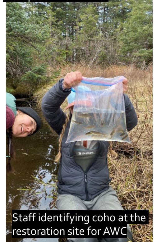
Staff identifying coho at the restoration site for AWC