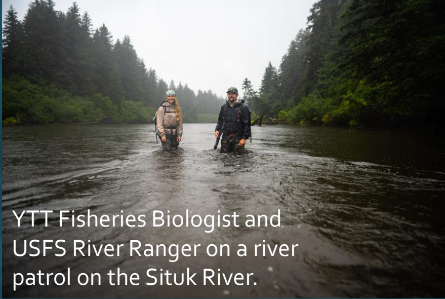
YTT Fisheries Biologist and USFS River Ranger on a river patrol on the Situk River.