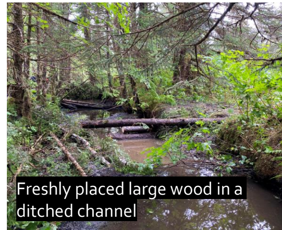
Freshly placed large wood in a ditched channel