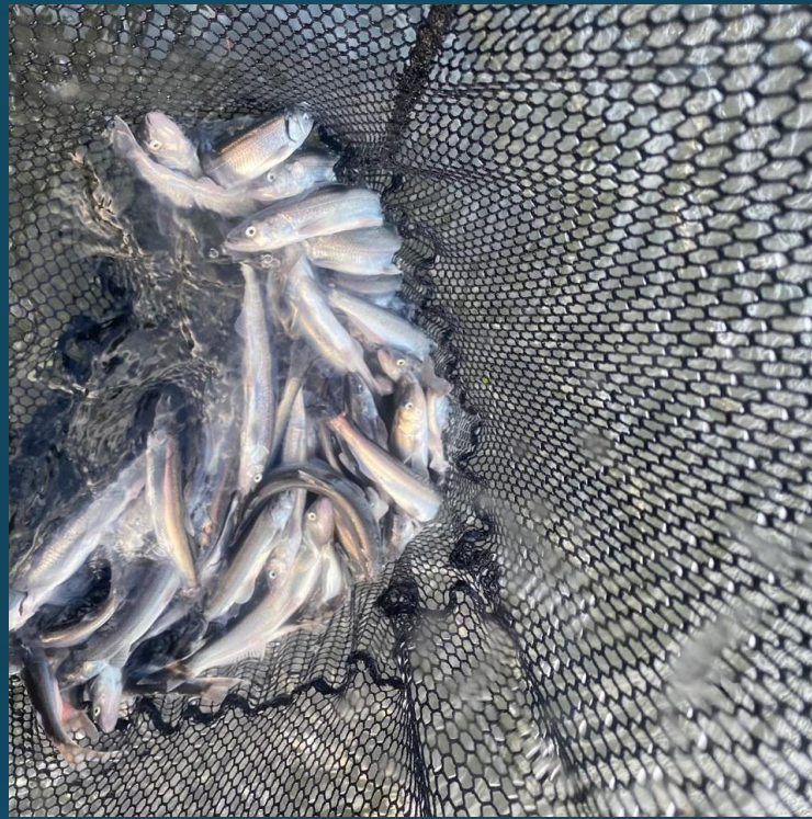
Eulachon captured in a dipnet