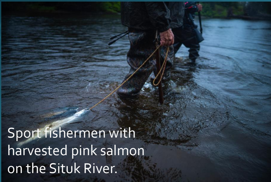
Sport fishermen with harvested pink salmon on the Situk River.