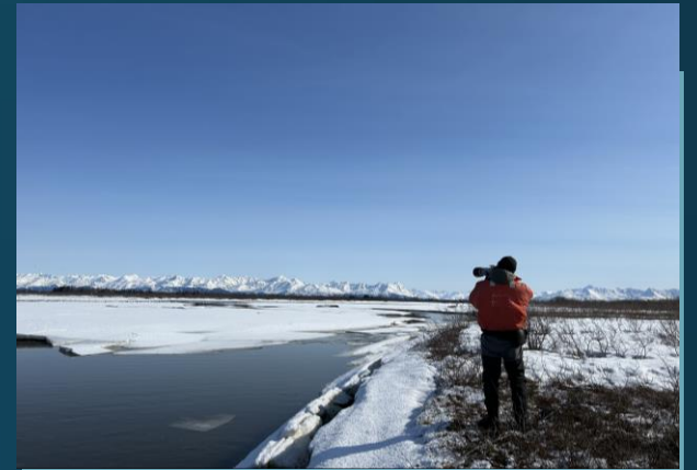
Staff observing bird activity at the mouth of the snowy Arhnklin River.