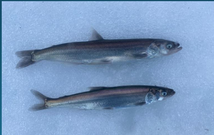
A male and female eulachon