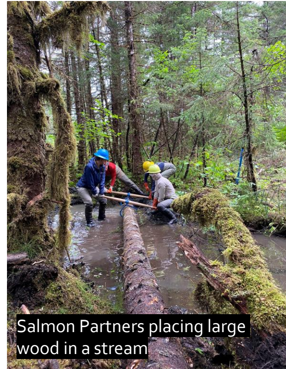
Salmon Partners placing large wood in a stream