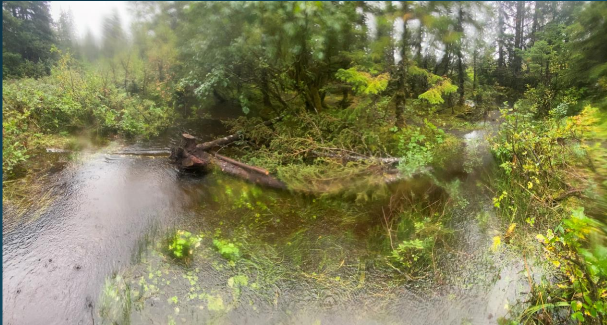
Restoration site with large woody debris at high flows