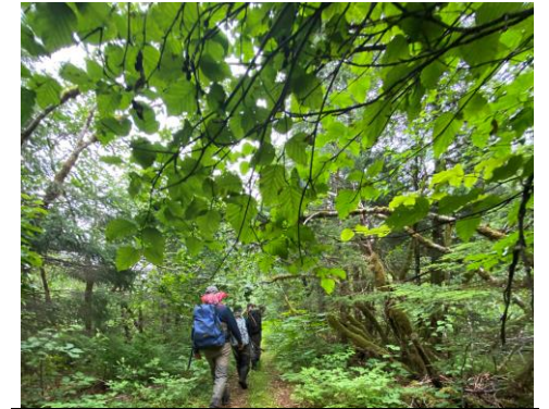
Staff walking on an abandoned road prism from WWII