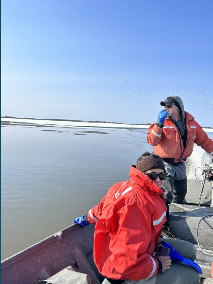
USFS and YTT staff traveling by jetboat to their eulachon eDNA site on the Arhnklin River.