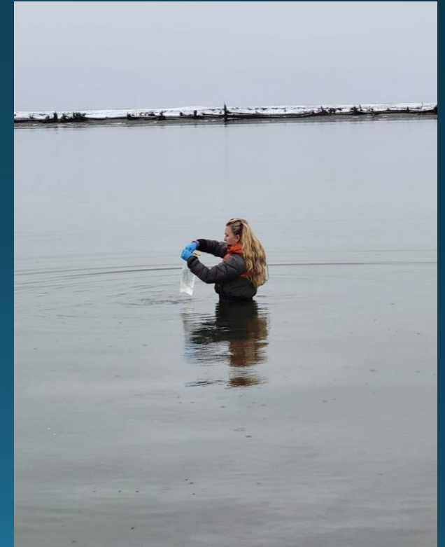
Staff taking an eDNA sample