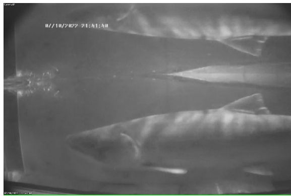
Underwater Image of Sockeye Salmon Passing the Tanada Creek Weir, 2022