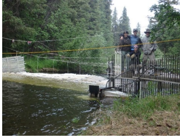
Photo of Tanada Creek Salmon Weir and Crew, 2022