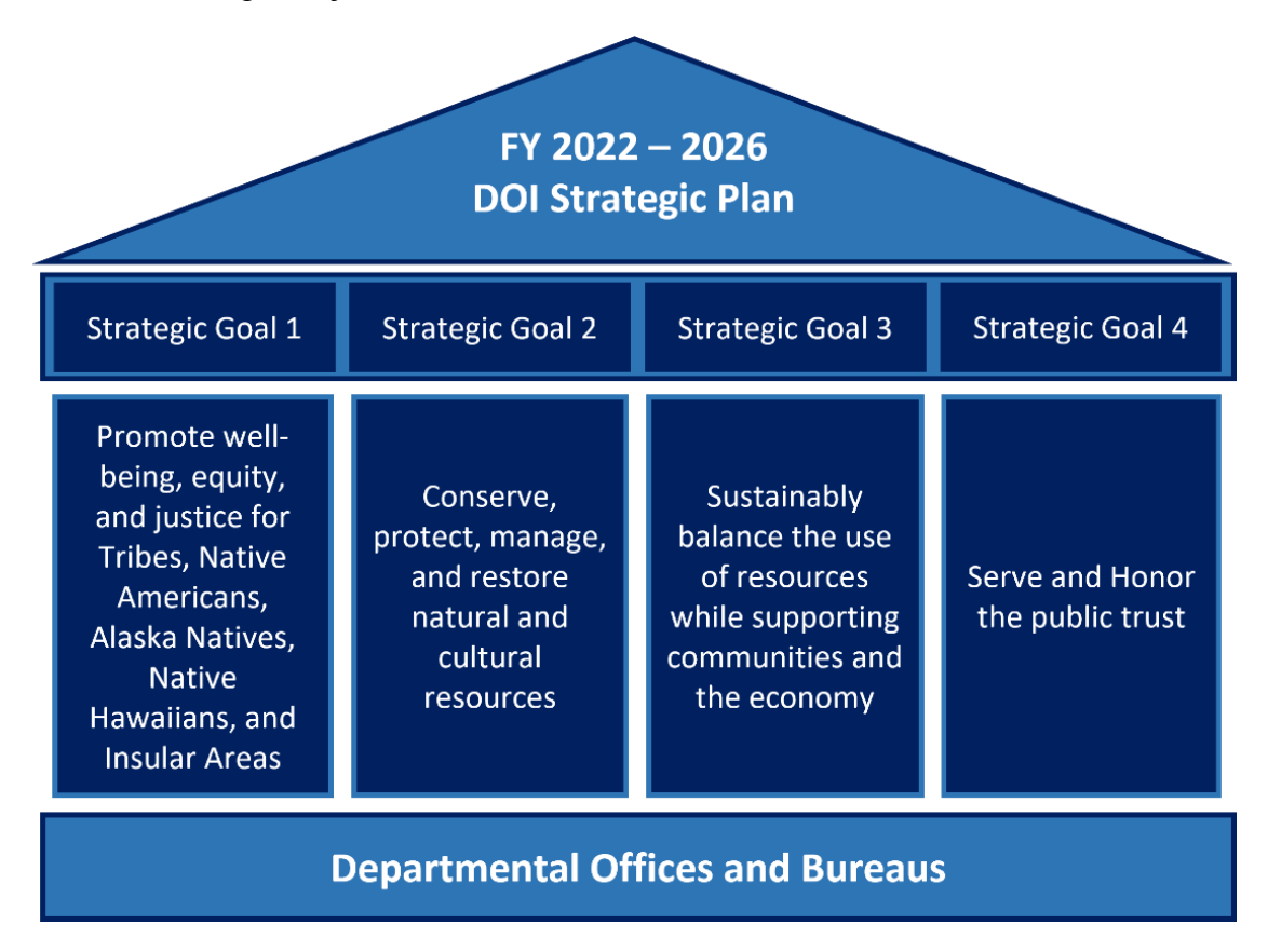
Figure 3. FY 2022 – FY 2026 DOI Strategic Framework

4.2) and to ensure that the DOI workforce is diverse, safe, engaged, and committed to the DOI mission (DSP Strategic Objective 4.3).