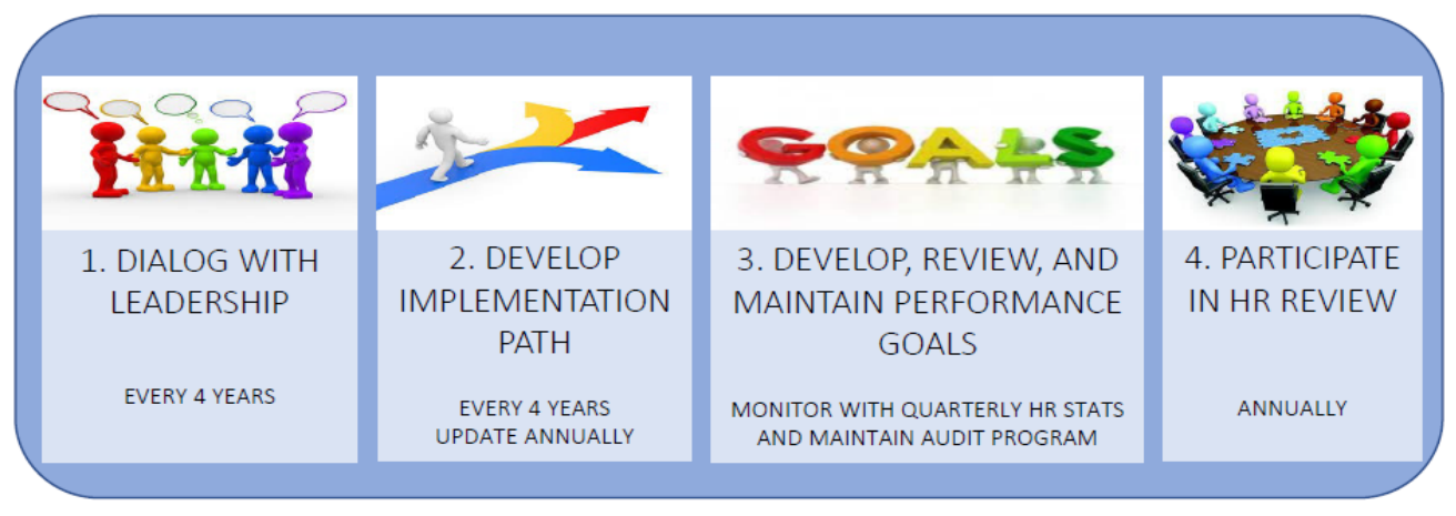
Figure 1. HCOP Life Cycle

In the first year of this HCOP's implementation, the CHCO along with other Departmental leadership met with the U.S. Office of Personnel Management (OPM) for a Human Capital Review to discuss various priorities contained within the HCOP. This midyear review, along with quarterly monitoring of measures as part of HRStat activities, informed the revisions to this plan. This revision to the FY 2022 – 2026 HCOP supersedes the Department's original version dated July 2022 and serves as the first in the annual review lifecycle.