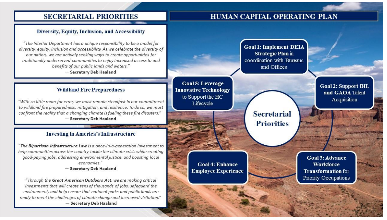
Figure 4. Secretarial Priorities and HCOP Goals